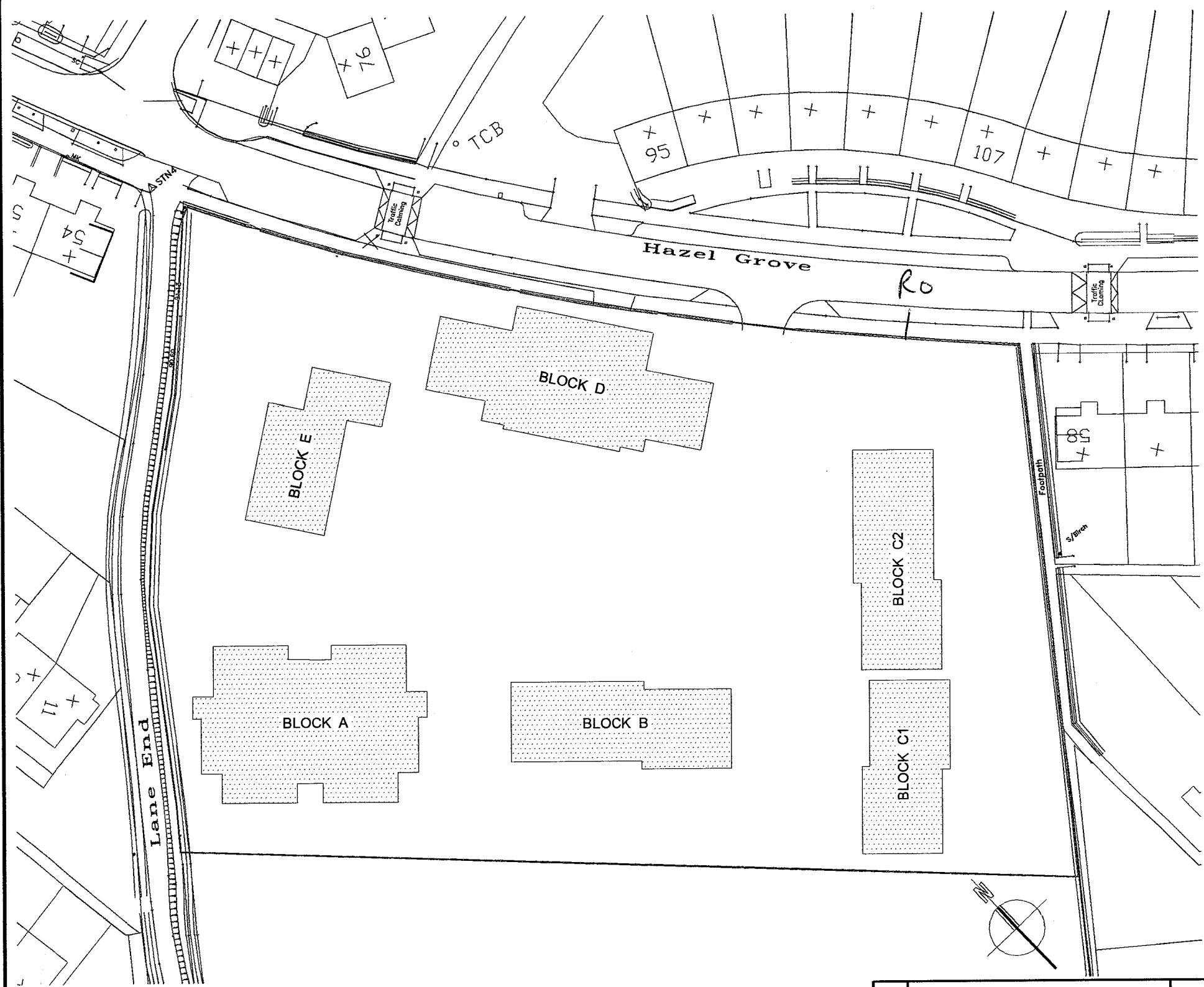
Proposed Site Block Plan 1:500 @A3