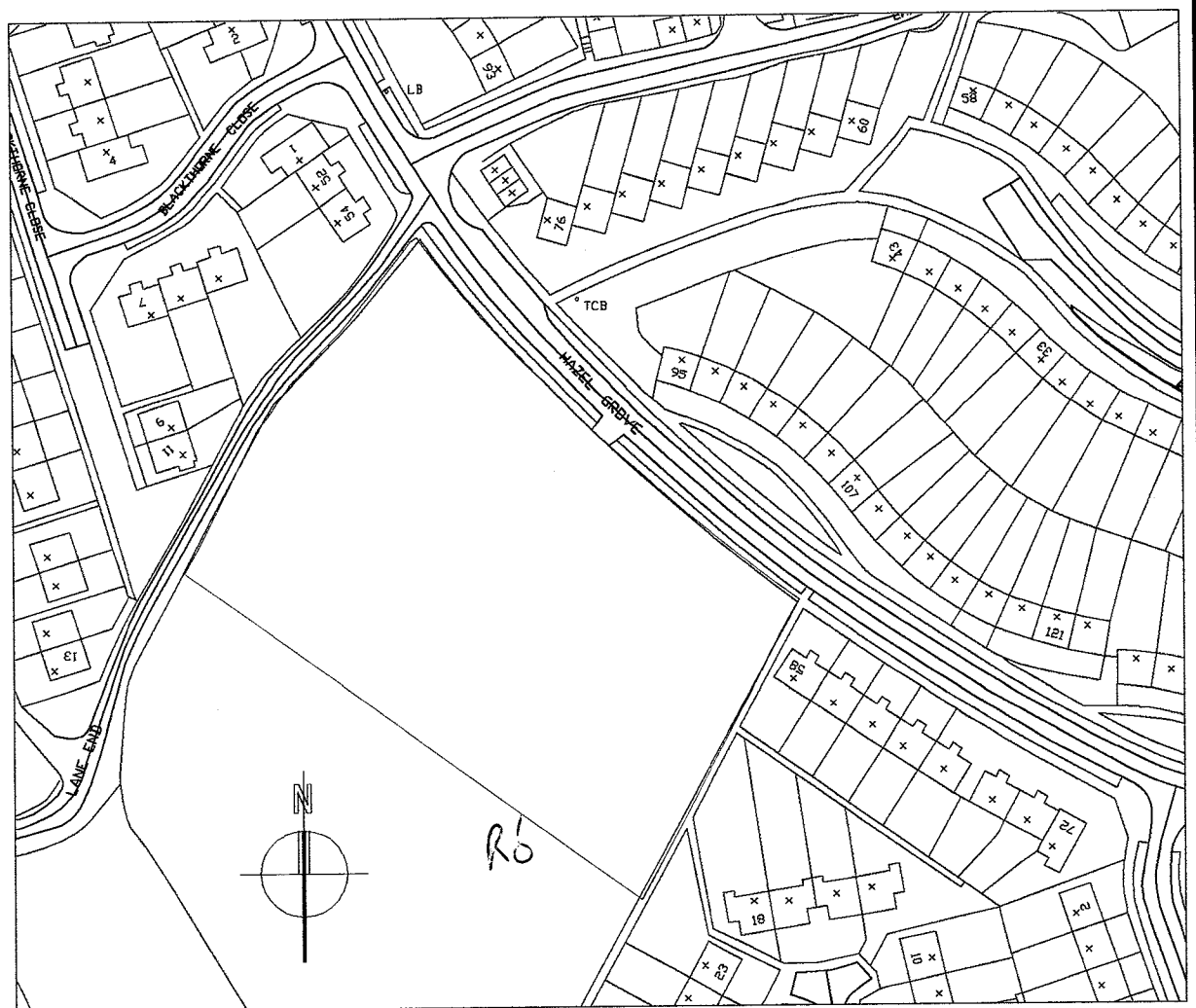
Location Plan 1:1250 @A3

WELWYN HATFIELD PLANNING OFFICE COPY 19 JUN 2007 No: S6/2007/925/M4