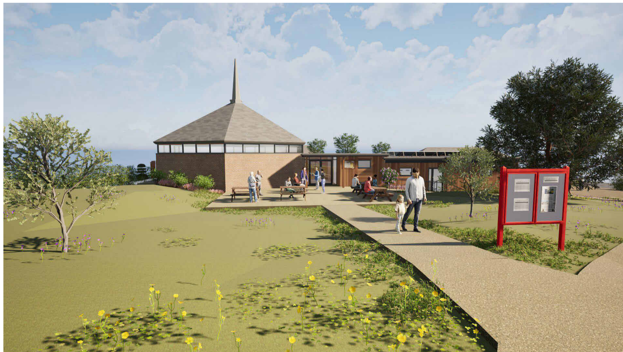
Main Entrance Perspective