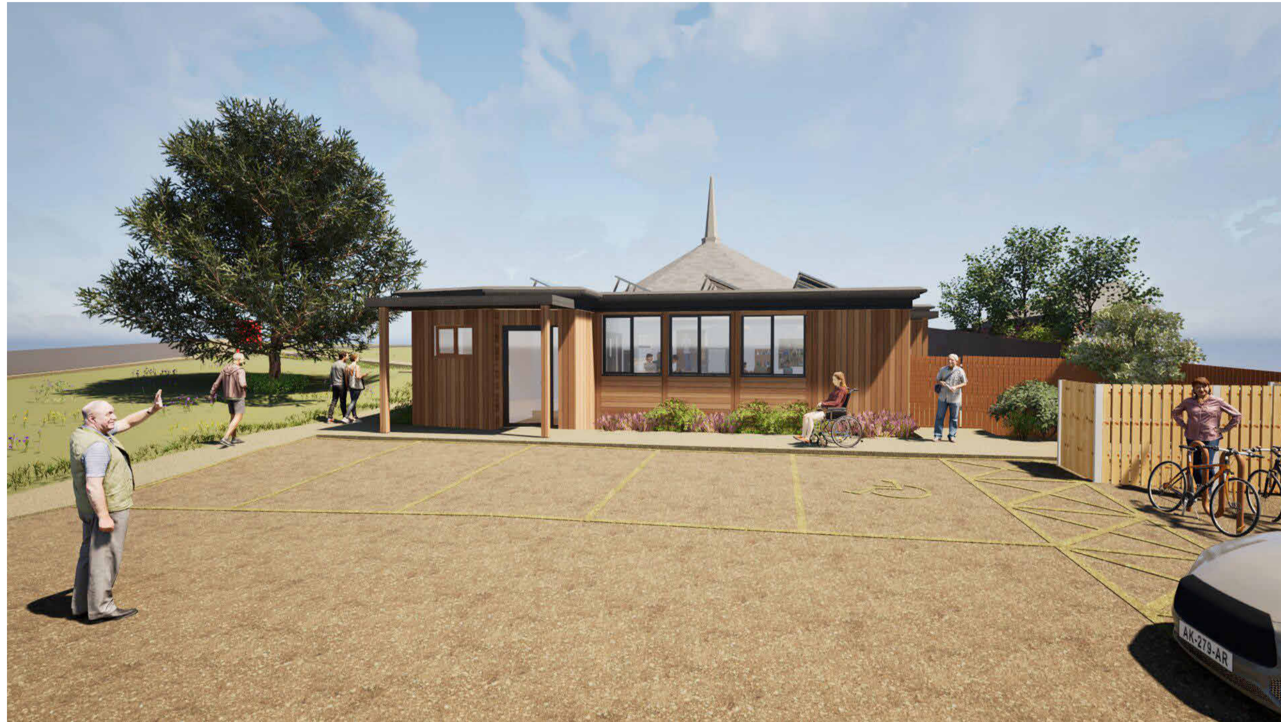
Car Park Perspective