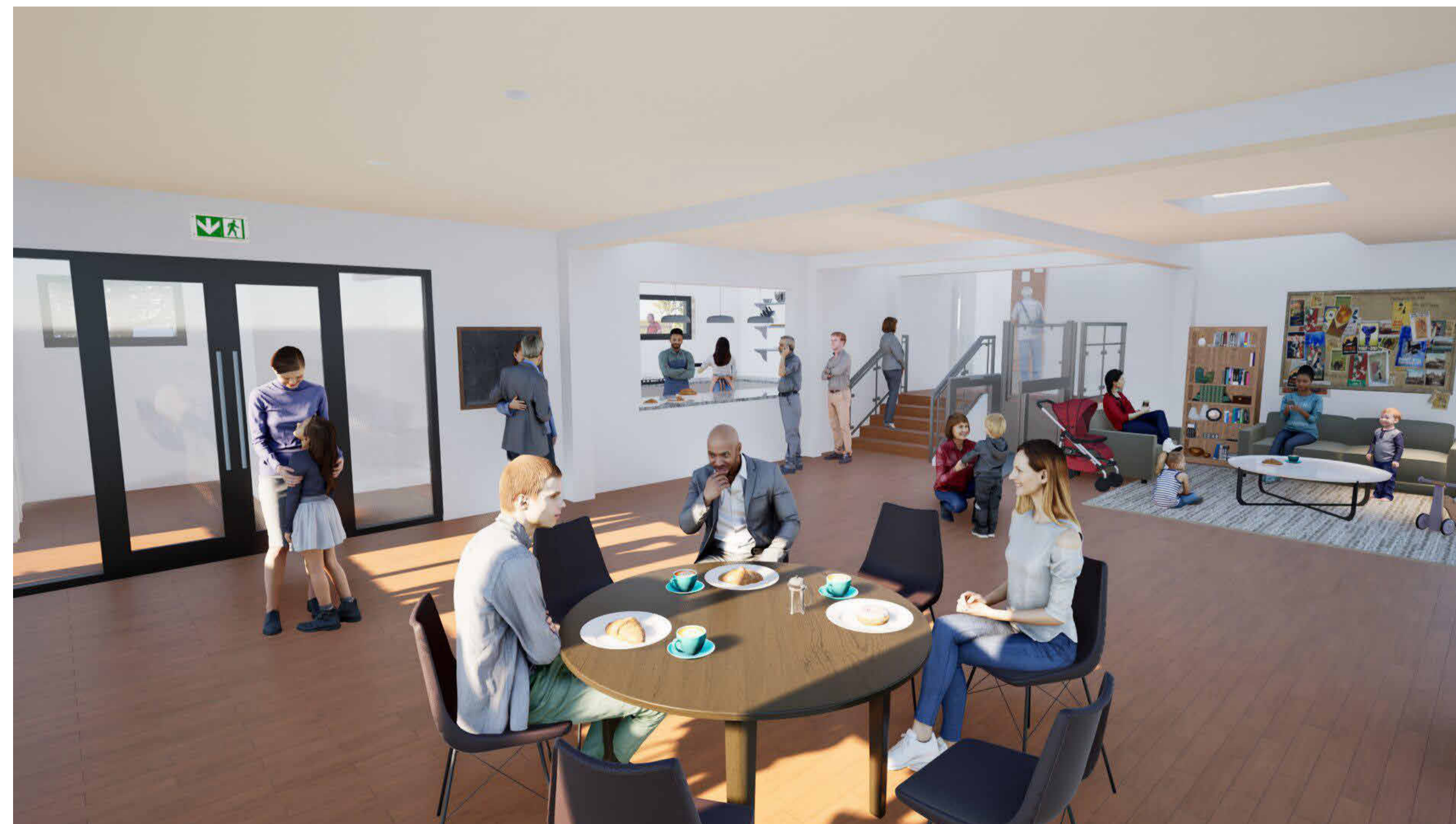
Main Hall Perspective