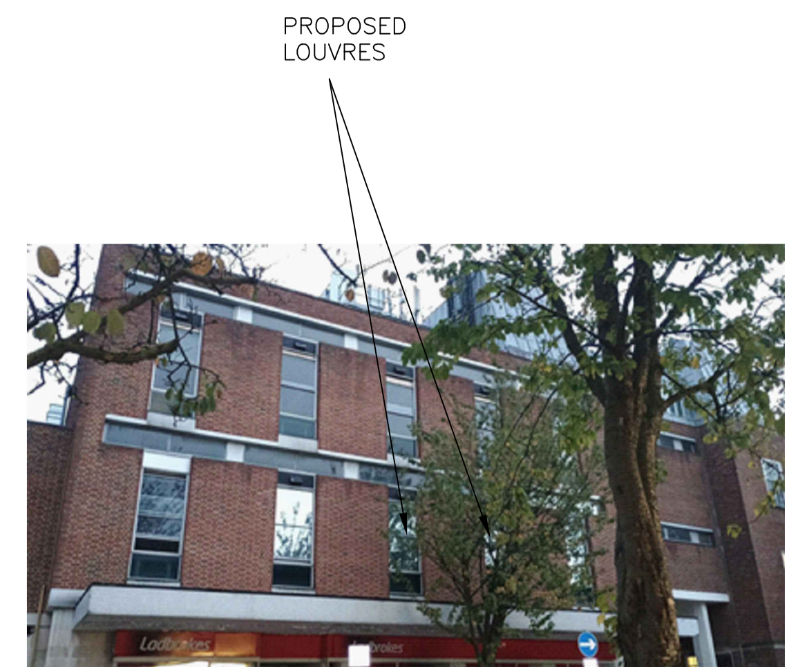
PHOTO OF EAST ELEVATION