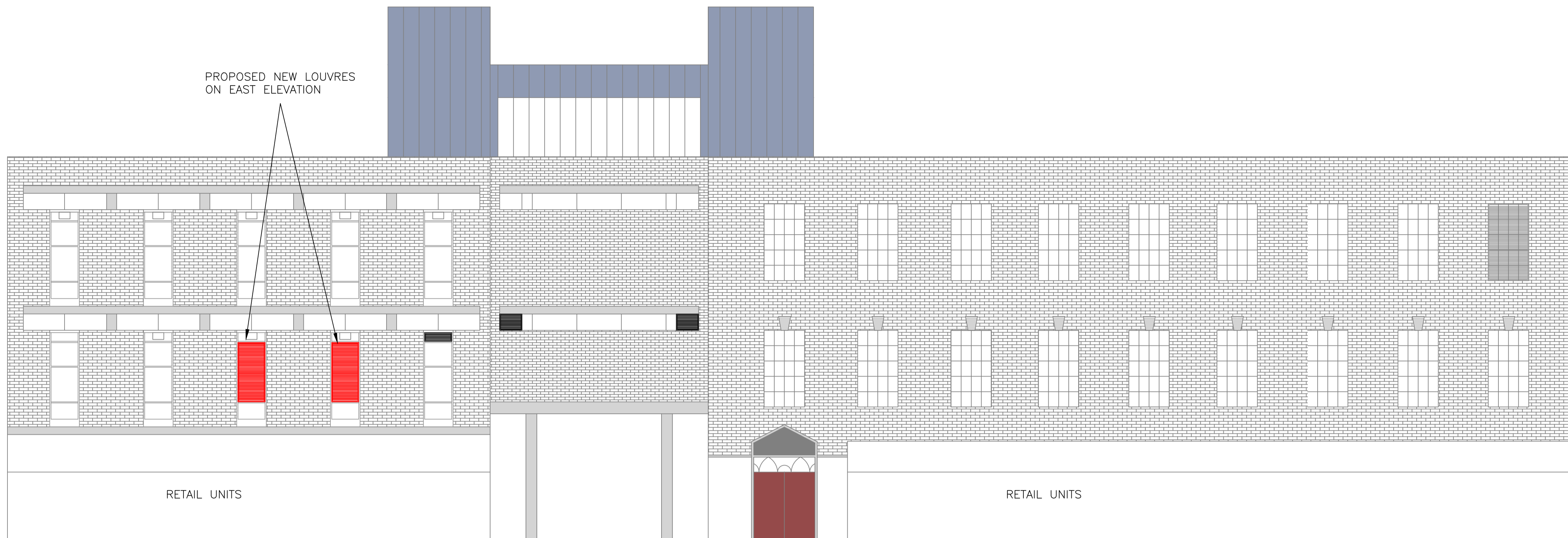
PROPOSED EAST ELEVATION (1:100)