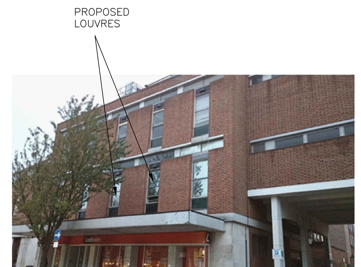
PHOTO OF EAST ELEVATION