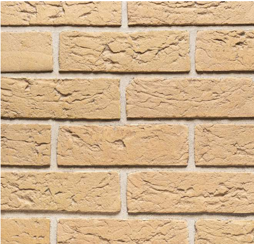
Image 1 - Anglian Cream Handmade