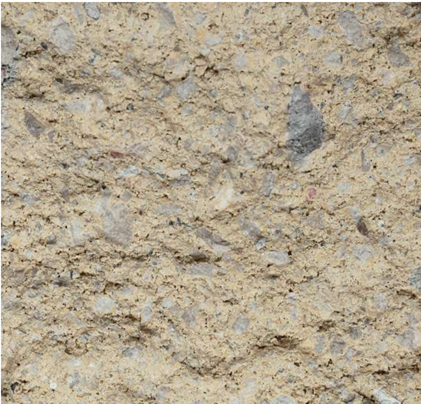
Image 3 - Bathstone Split-face Finish

Application/Location: All below ground floor slab elevations Product: Anstone Range - Bathstone Finish: Split-face Mortar: Natural sand/cement (bucket handle) https://www.ibstock.co.uk/product/architectural-masonry/split-face-classic?page=2&