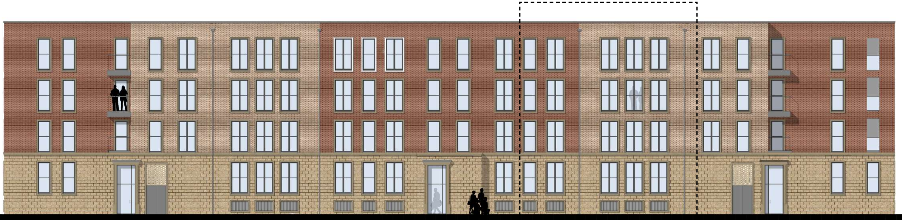
Typical Elevation Treatment & Material Finishes (North Elevation)