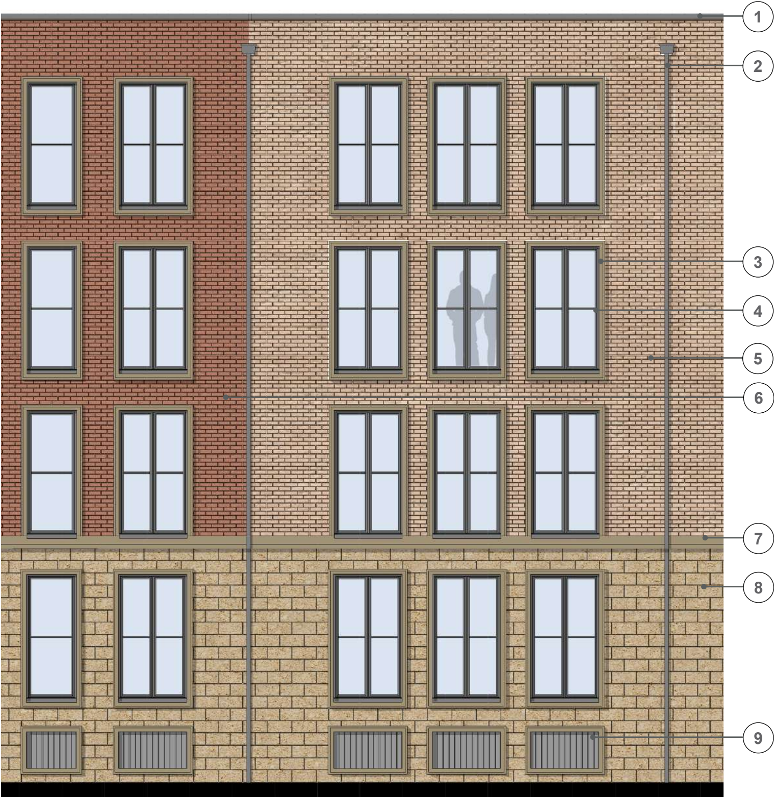
Bay Elevation Treatment & Material Finishes (North Elevation)