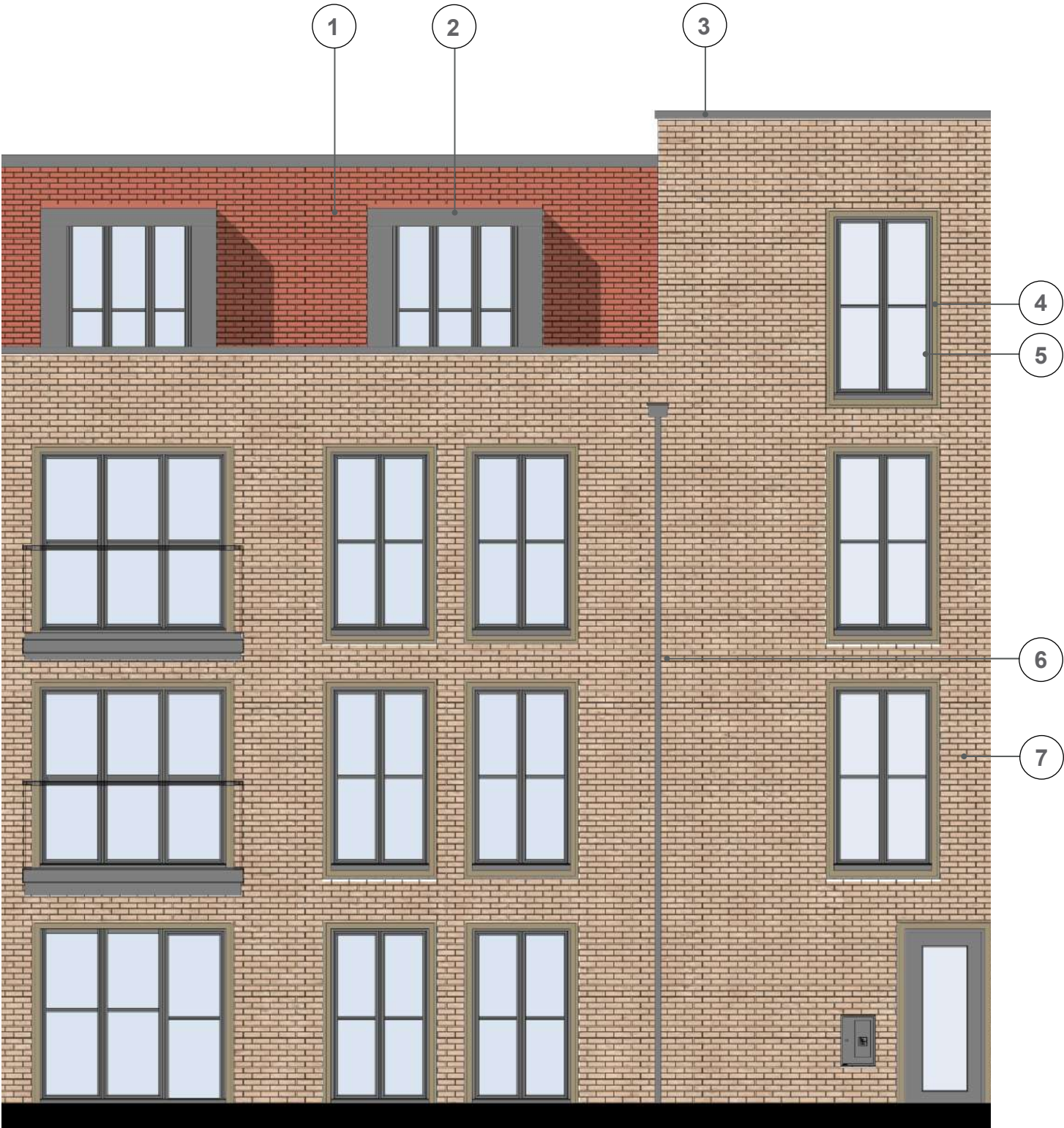
Bay Elevation Treatment & Material Finishes (East Courtyard Elevation)