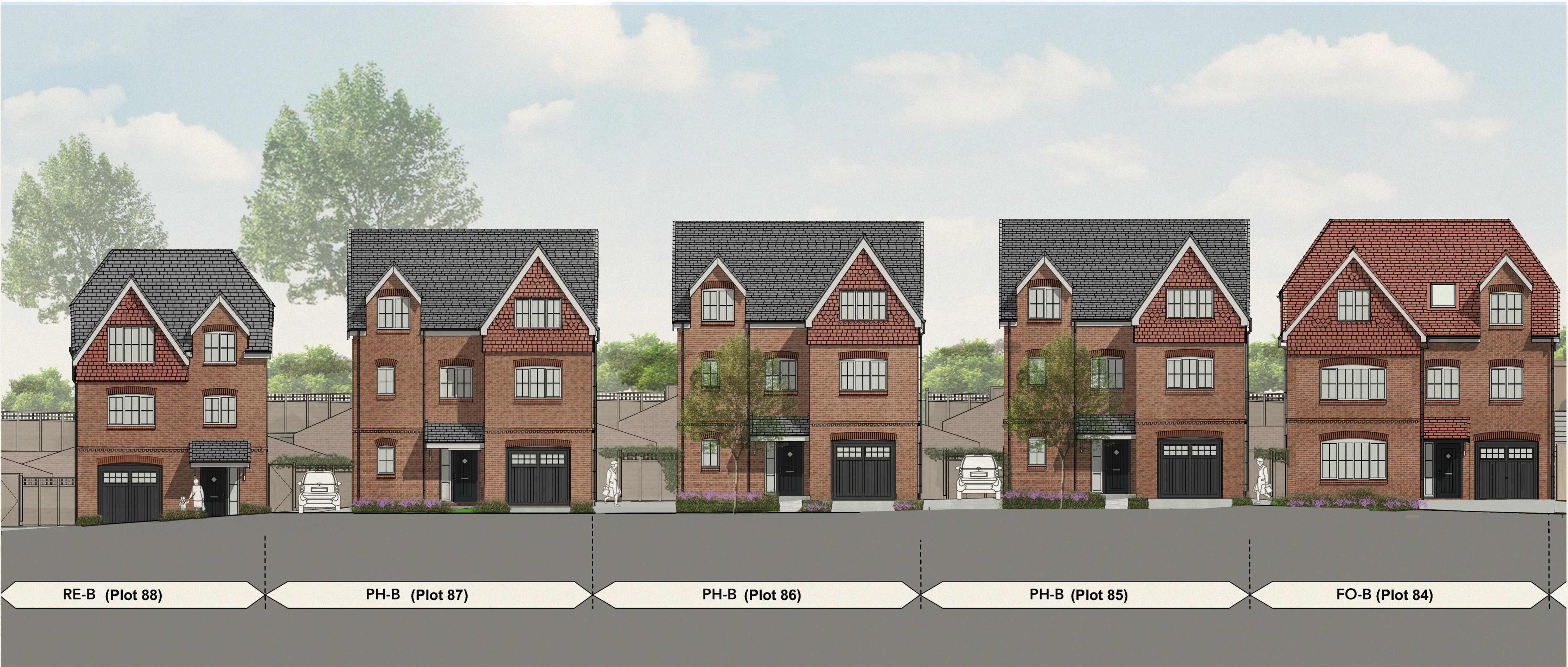
Front Street Elevation Extract 1:100