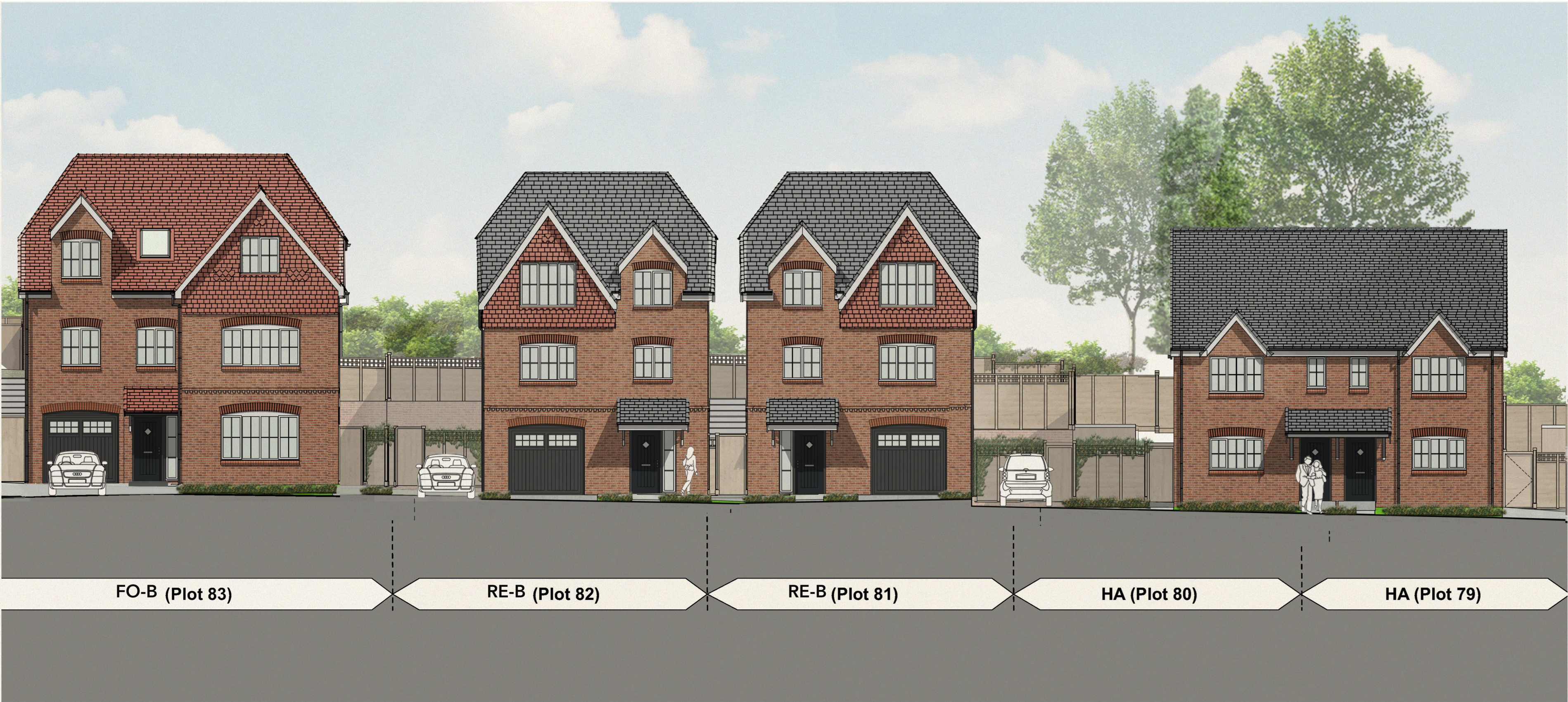
Front Street Elevation Extract 1:100