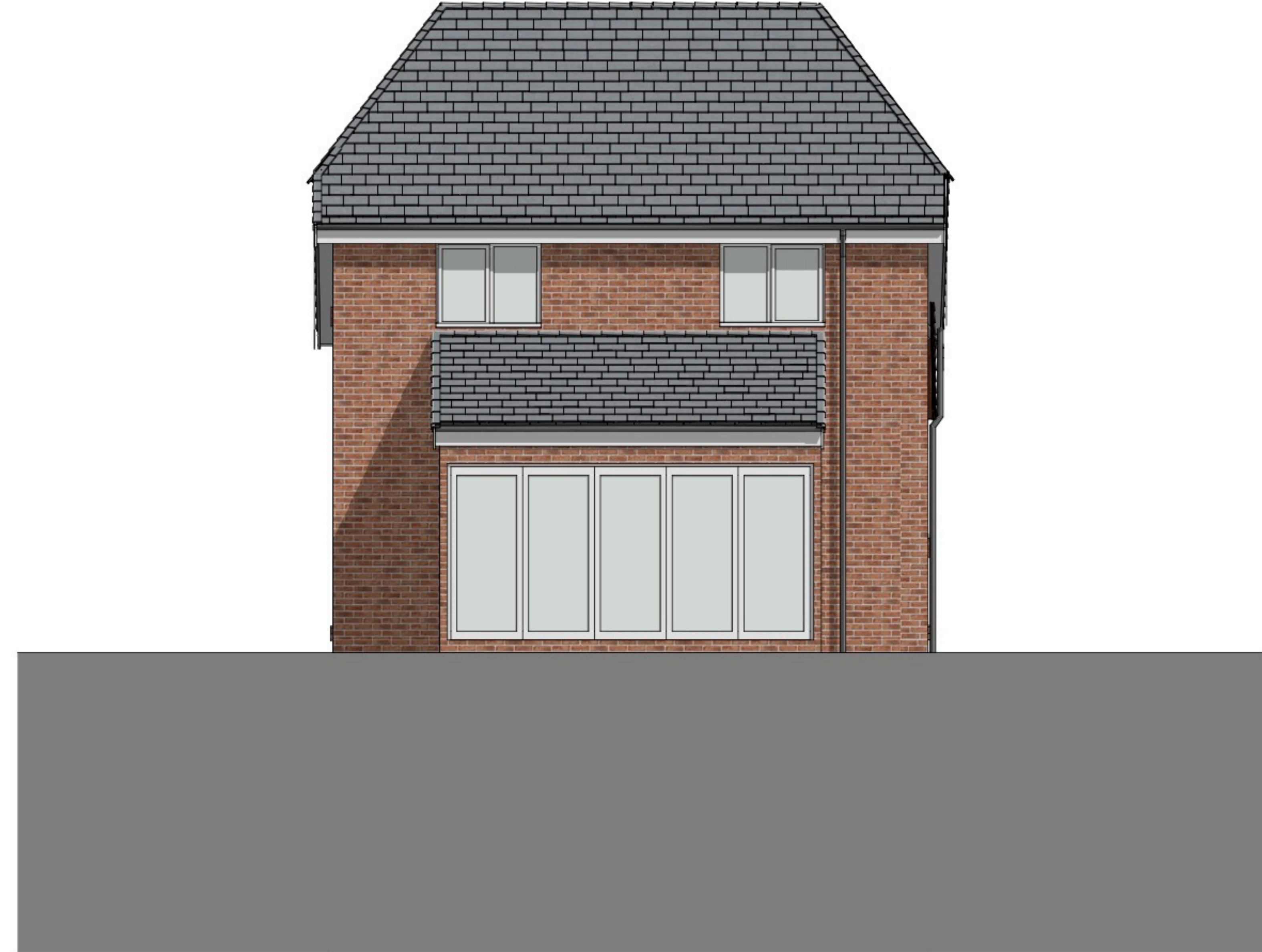
An architectural elevation drawing of a two-story brick house. The house features a gabled roof with grey shingles. A small dormer window with a white frame is positioned on the upper floor. The main facade is constructed of red brick. A double door with white frames is located on the right side of the ground floor. A horizontal line of decorative elements, possibly a string of beads or a row of small windows, runs across the middle of the brick wall. The house is set against a plain white background, with a grey base representing the ground level.

Reedmaker Bespoke 5 bed 8 person house Plots: 82,88 Handed: 81