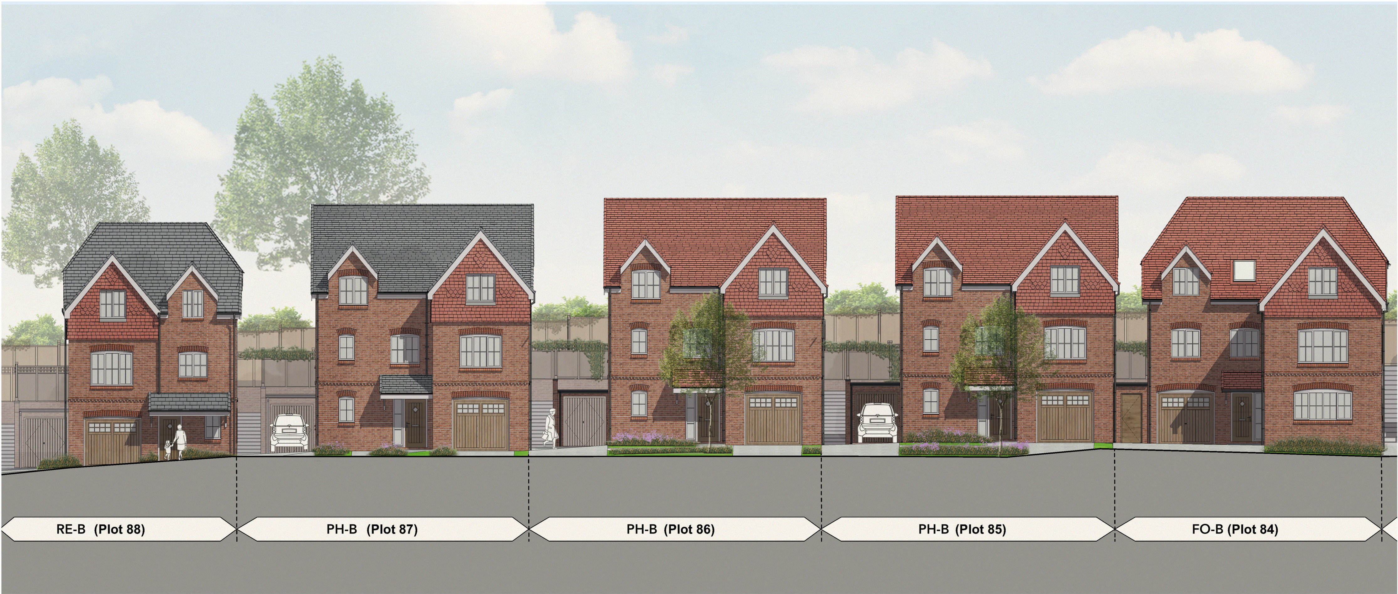
Front Street Elevation Extract 1:100