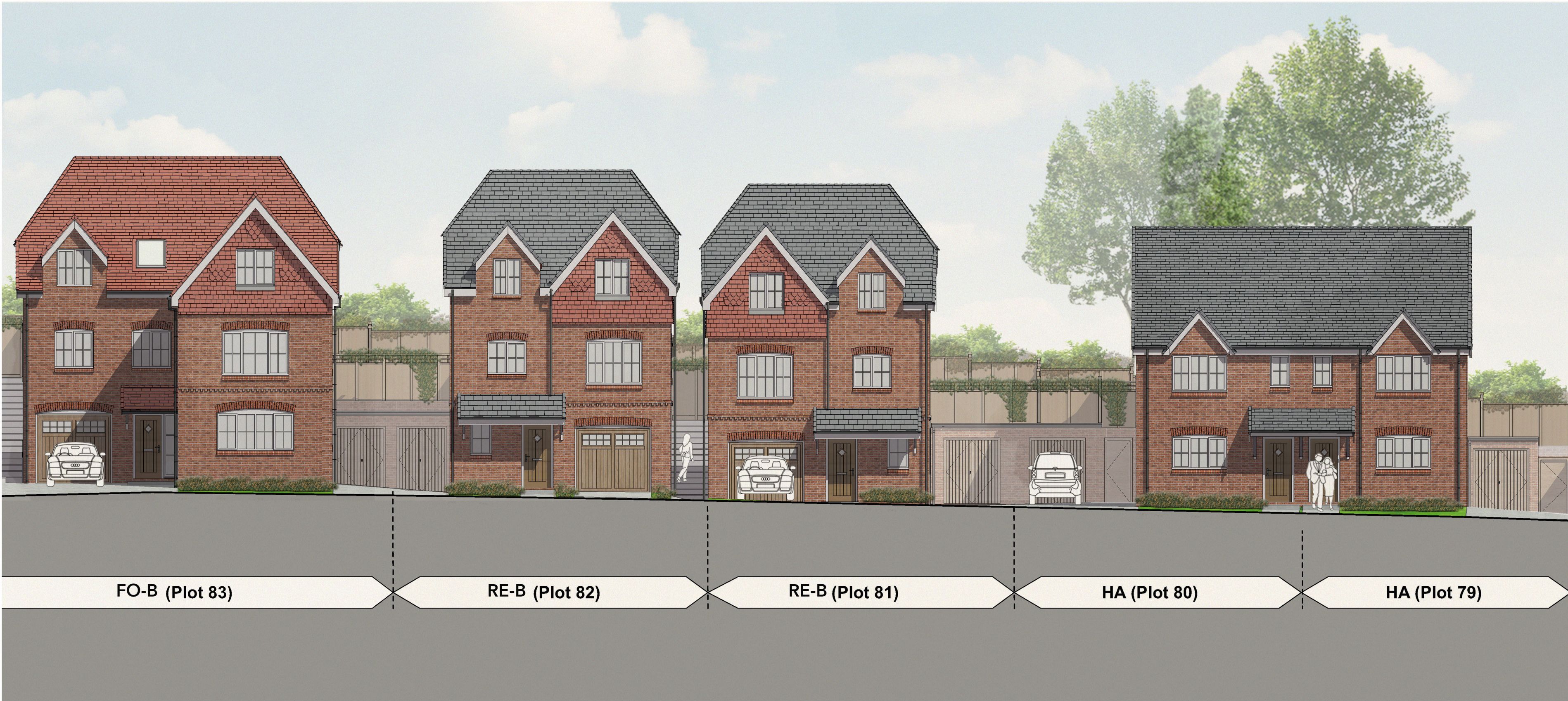
Front Street Elevation Extract 1:100

This document is © Gardner Stewart Architects. This drawing is to be read in conjunction with drawings prepared by the architects, structural engineers and service consultants and all other relevant details and information. Any relevant or discrepancies must be reported immediately to the architect. Do not scale: use figured dimensions only. All dimensions must be verified by the main contractor before the commencement on site of any item of work or the preparation of shop drawings for their own work or that of sub-contractor or suppliers.