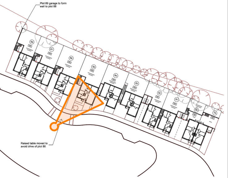
Key plan focused on plots 79-88

This document is © Gardner Stewart Architects. This drawing is to be read in conjunction with drawings prepared by the architects, structural engineers and service consultants and all other relevant details and information. Any relevant or discrepancies must be reported immediately to the architect. Do not scale: use figured dimensions only. All dimensions must be verified by the main contractor before the commencement on site of any item of work or the preparation of shop drawings for their own work or that of sub-contractor or suppliers.