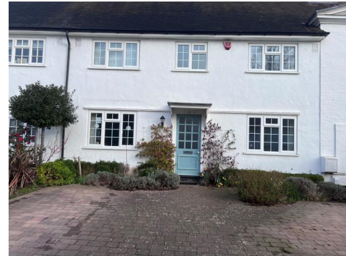
Above – existing view, from driveway and from path