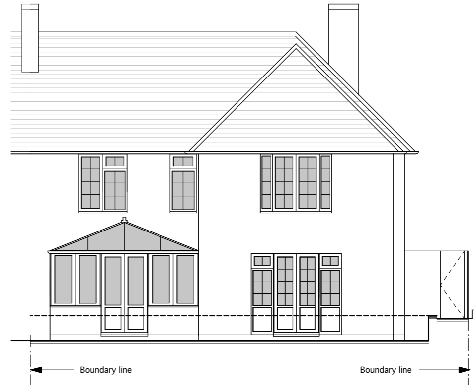
4 66 Brockwood Lane Rear / Garden Elevation 1:100