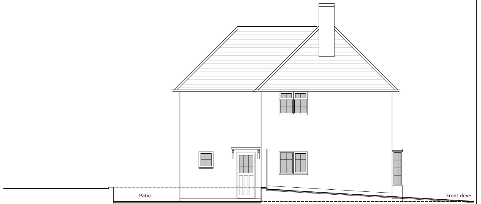
2 66 Brockwood Lane Side /West Elevation 1:100