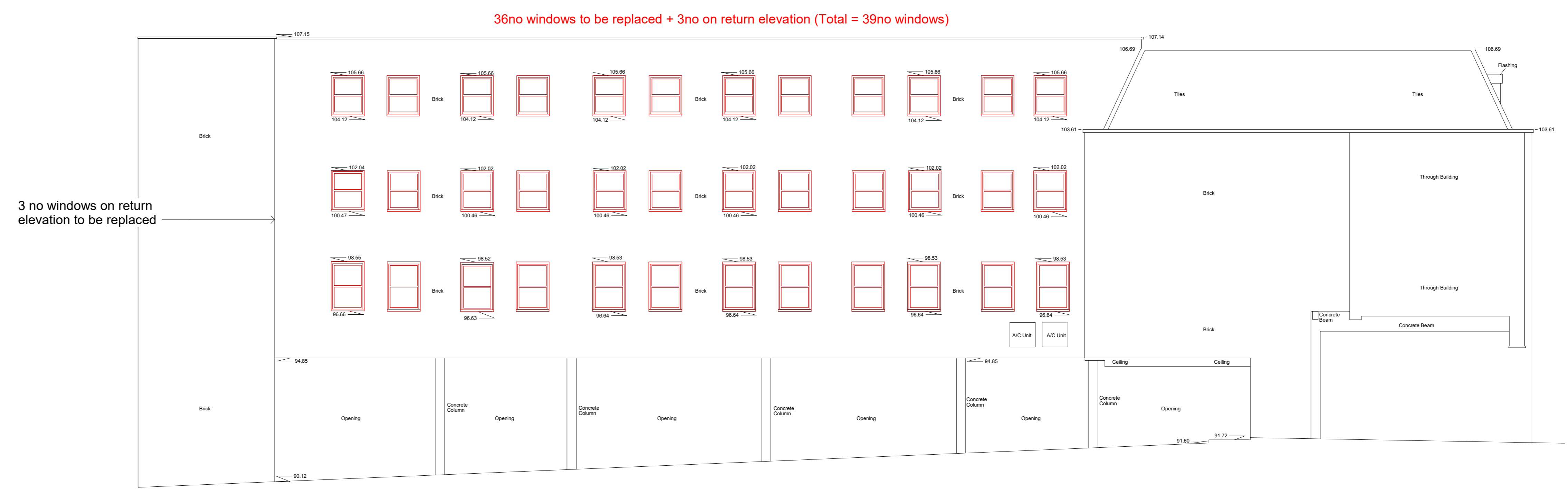
Elevation D - Windows Being Replaced are Shown In Red - Proposed 1 : 100