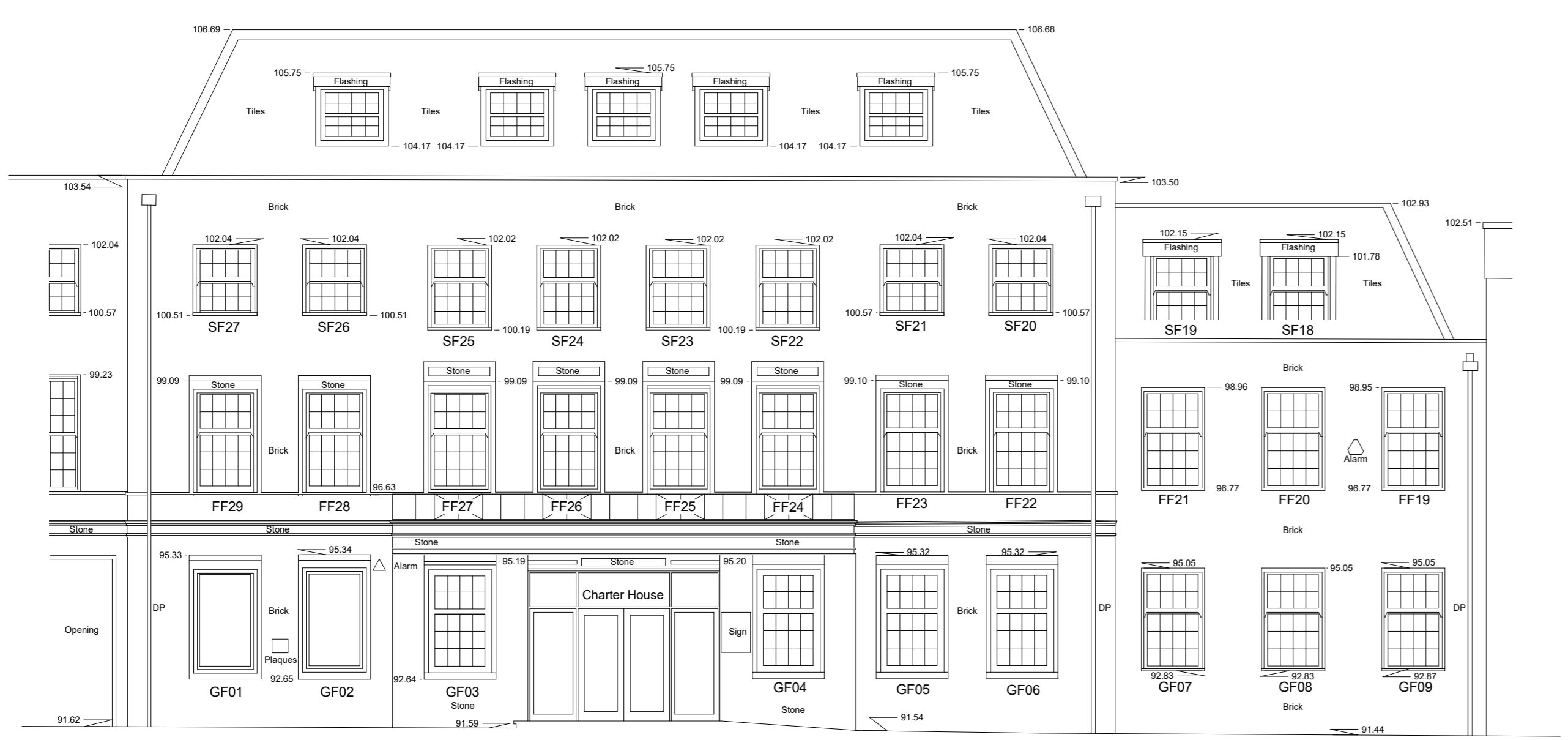
Elevation A - No Window Replacements - Proposed 1 : 100