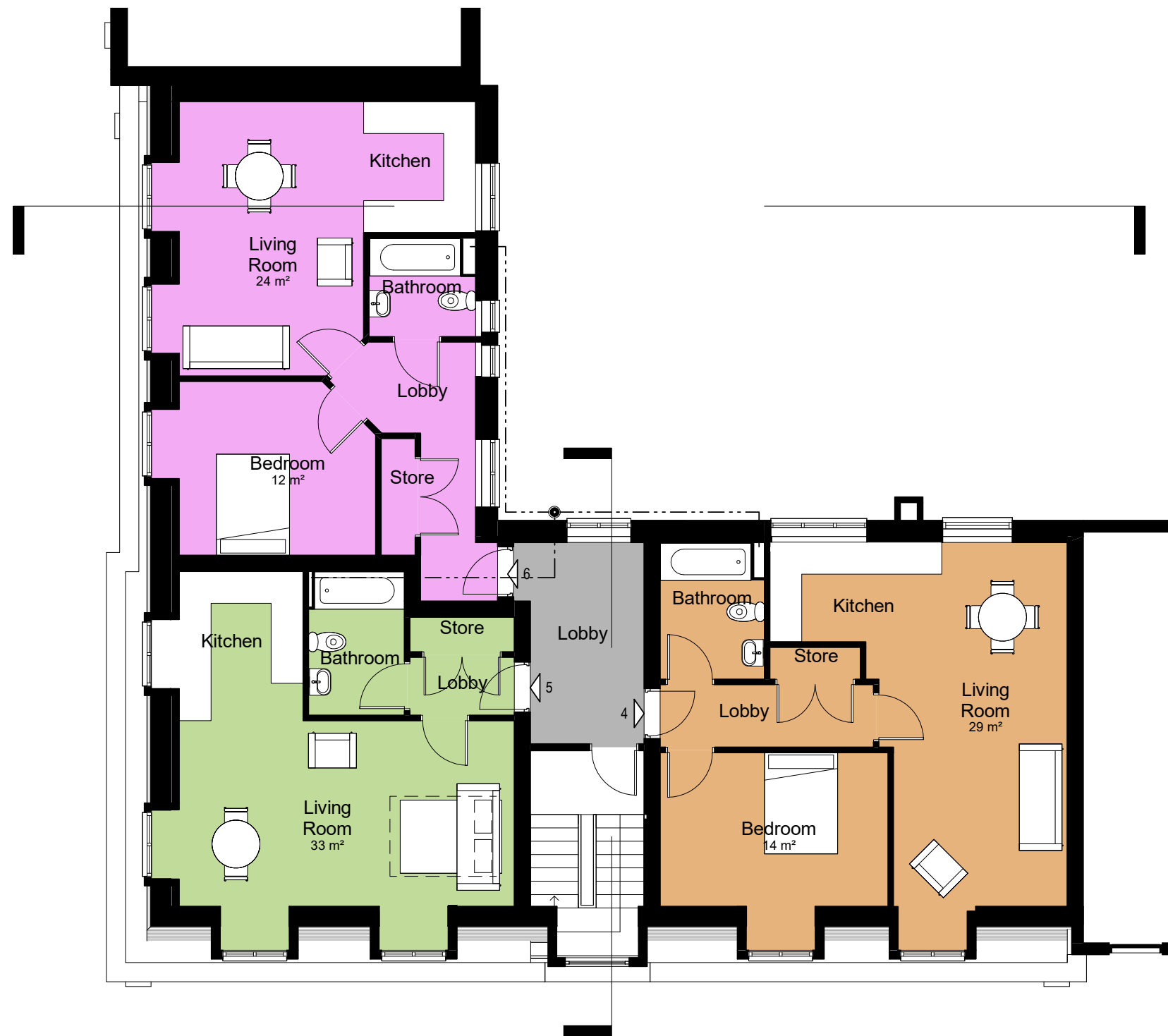
Proposed Second Floor 1 : 100