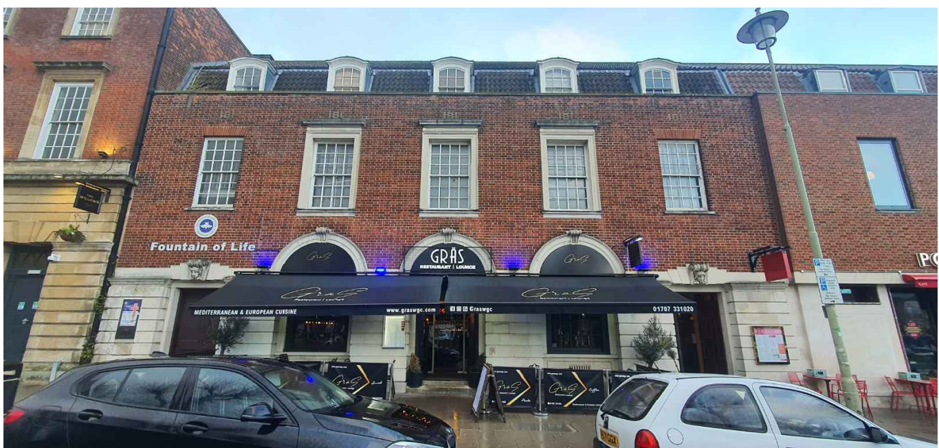
Existing/ Proposed shop Front