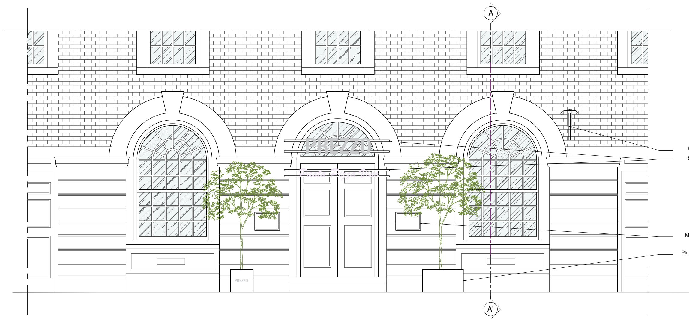
Pre-Existing Front Elevation