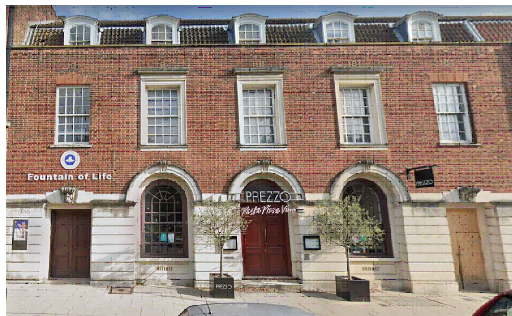
Pre-existing shop Front