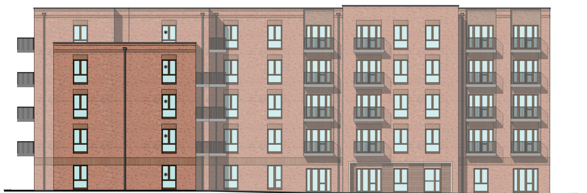
WEST ELEVATION (Green Spine)