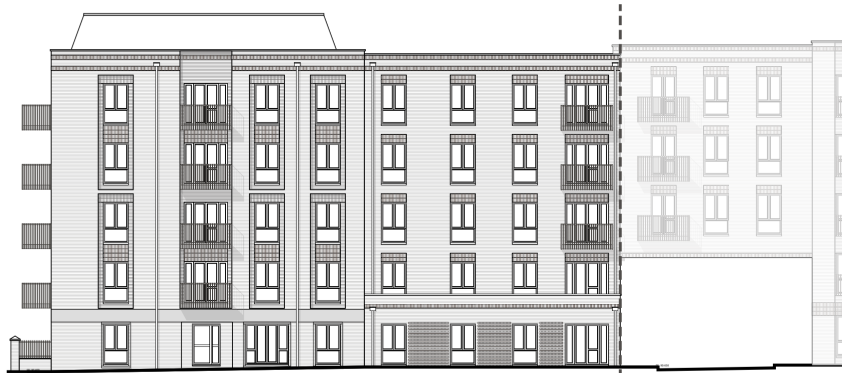
SOUTH ELEVATION (College Way)