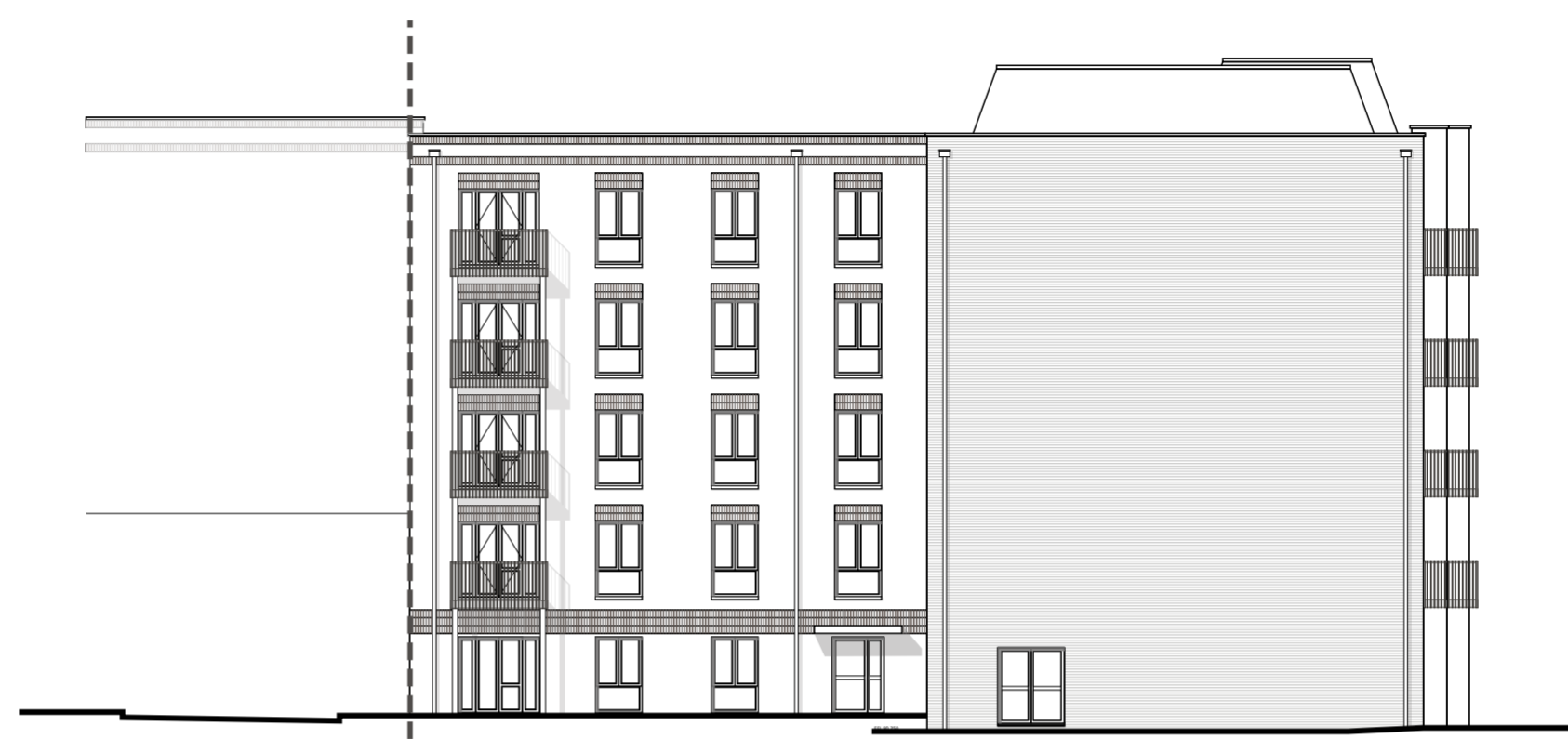
Block B3/B4 NORTH ELEVATION