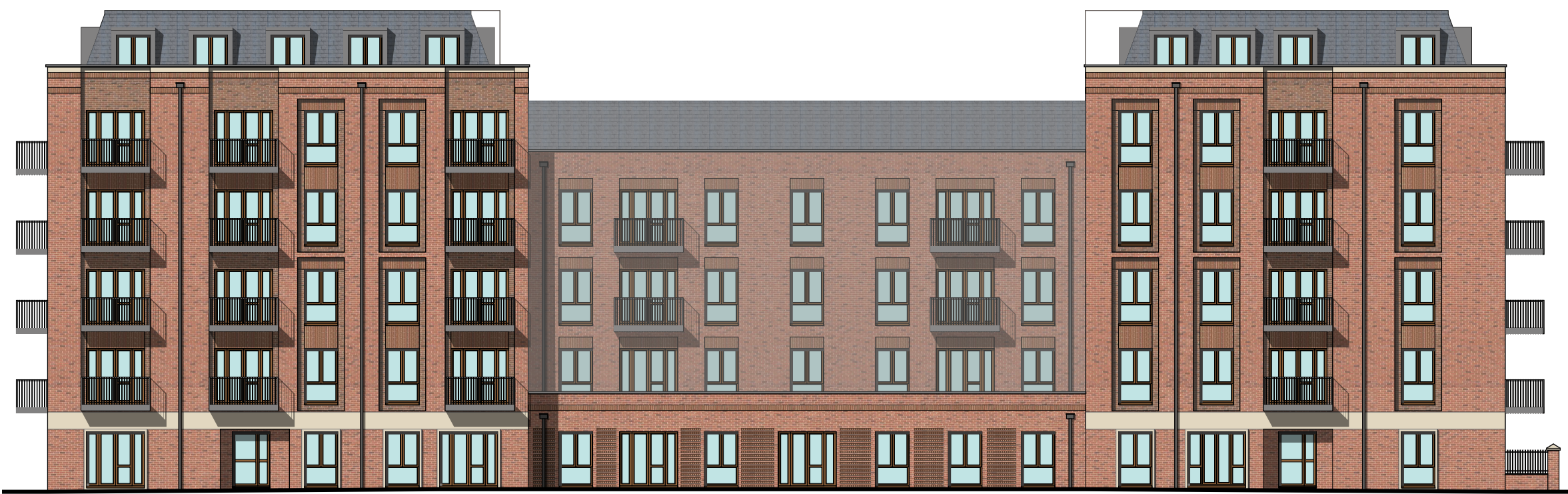
NORTH ELEVATION (College Way)