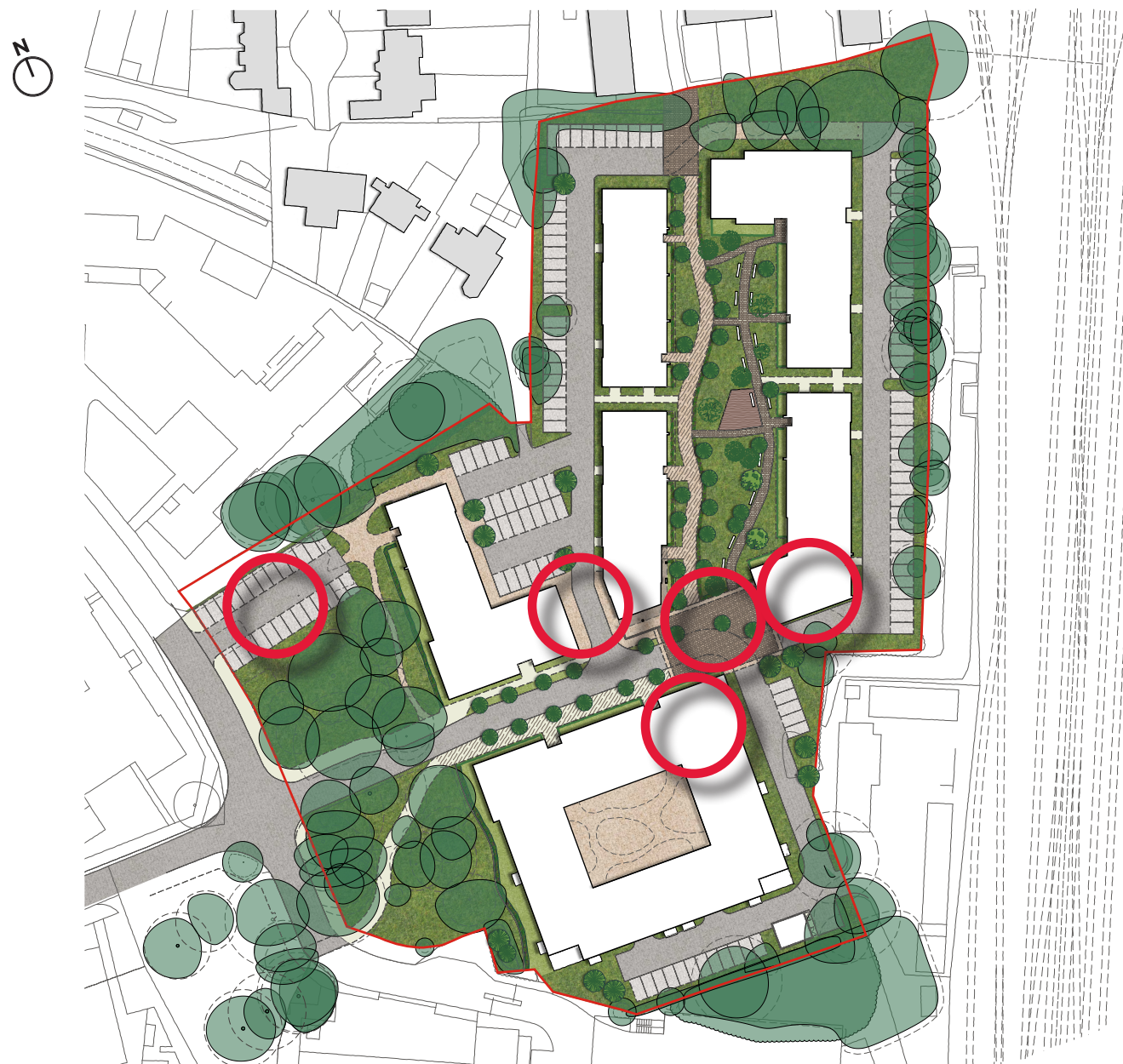
SITE LAYOUT - 11th Feb 2022 Pre-Application 4