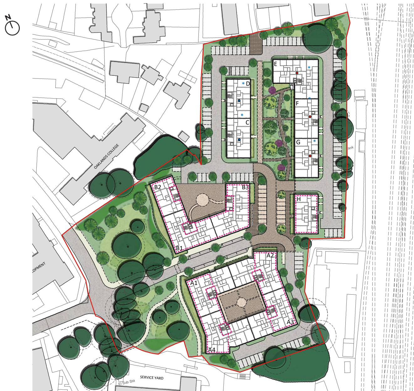
SITE LAYOUT – 4 TH Apr 2021 Bid Stage

A detailed layout was developed for the bid stage where a podium deck was incorporated on both blocks to the front of the site. The podium decks were developed to accommodate allocated parking while obscuring from view. The podiums were also used to provide amenity space to the courtyard of each block.