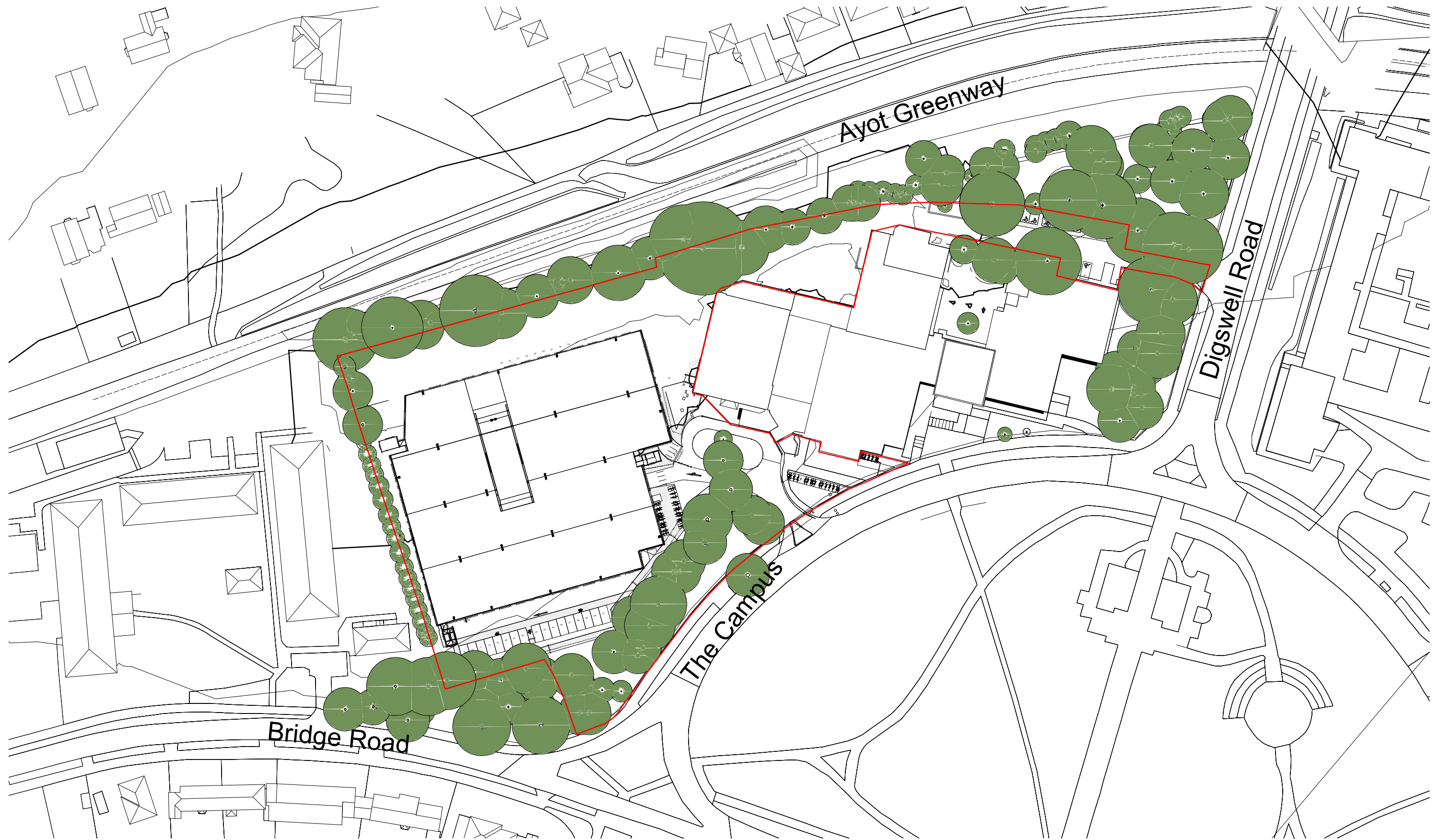
1 Proposed Block Plan P005 Scale - 1 : 1000