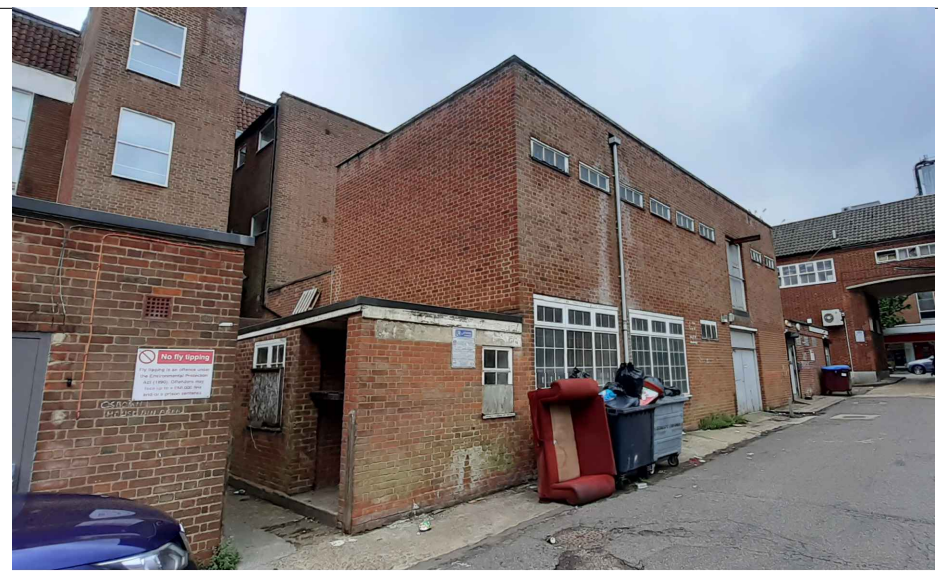
01 Photo 1 - Rear Parking lot street view