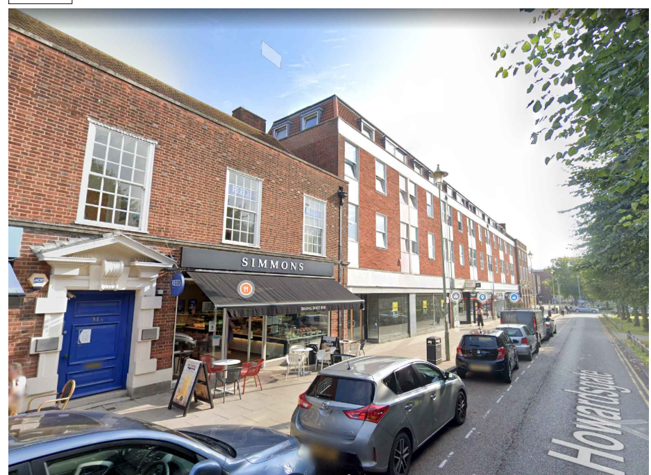
02 Photo 2 - Howardsgate street view