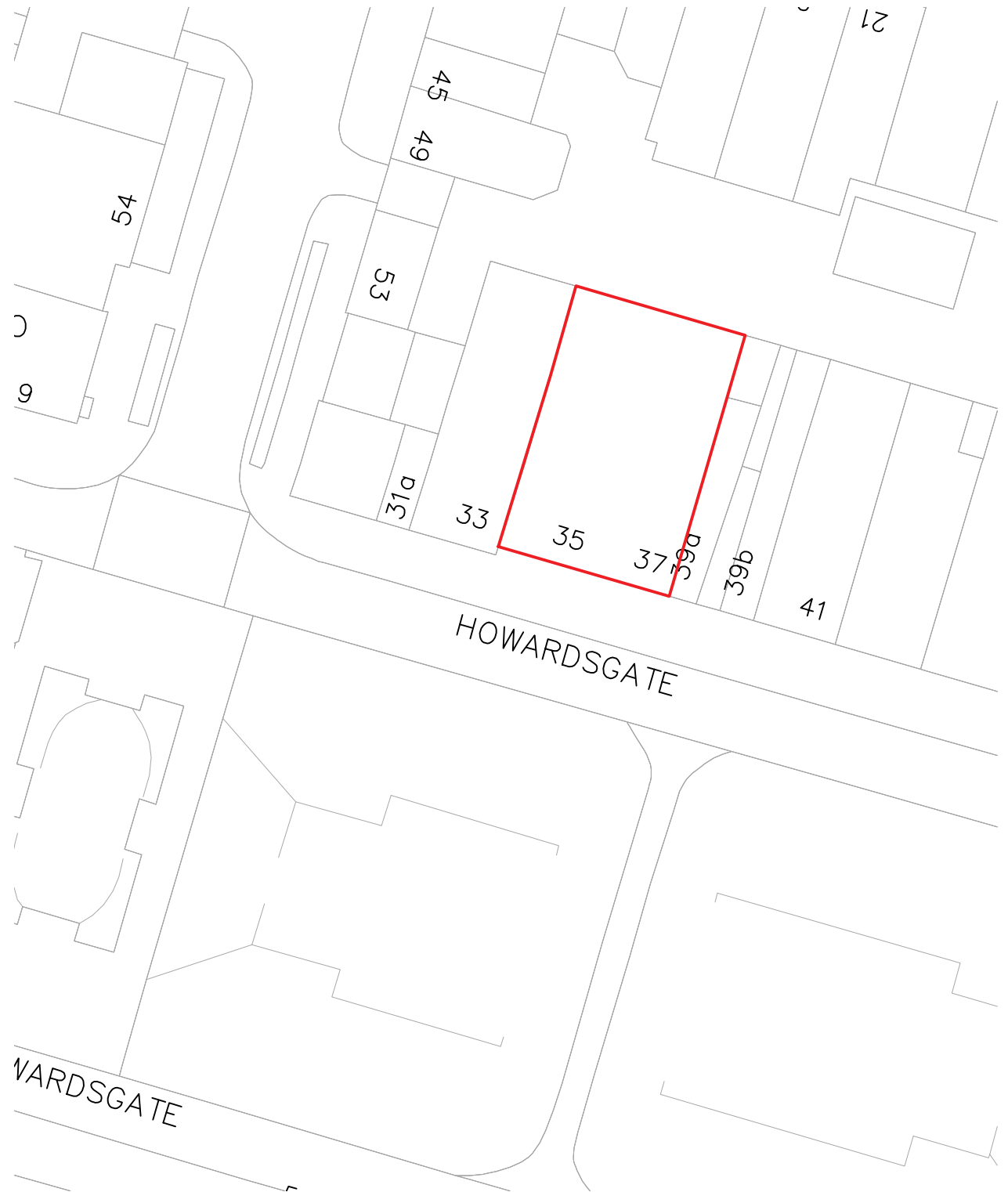
02 Block Plan 1:500 @ A3