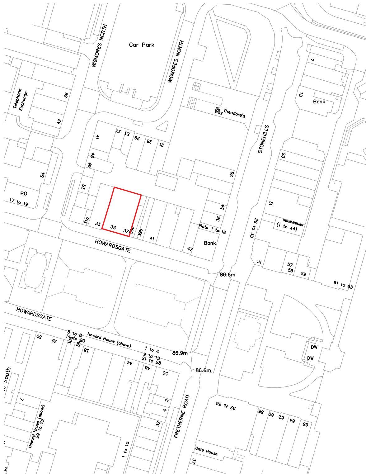
01 Location Plan 1:1250 @ A3