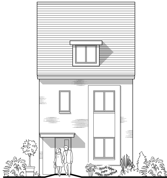
Front Elevation Plots: 4 & 38 - As drawn Plots: 3 & 39 - Handed