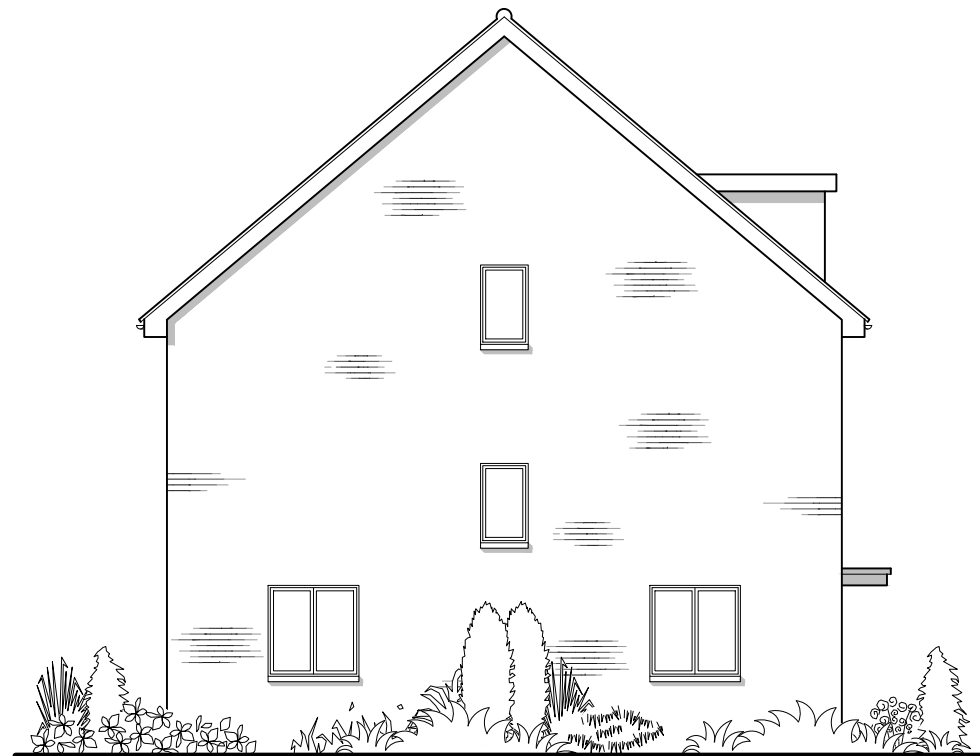
Side Elevation Windows to plot 4 only