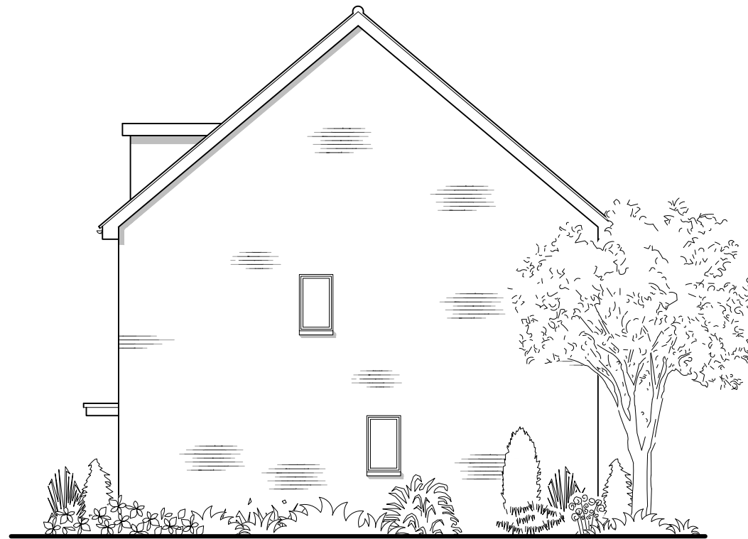
Side Elevation Windows to plots 25 & 26 only