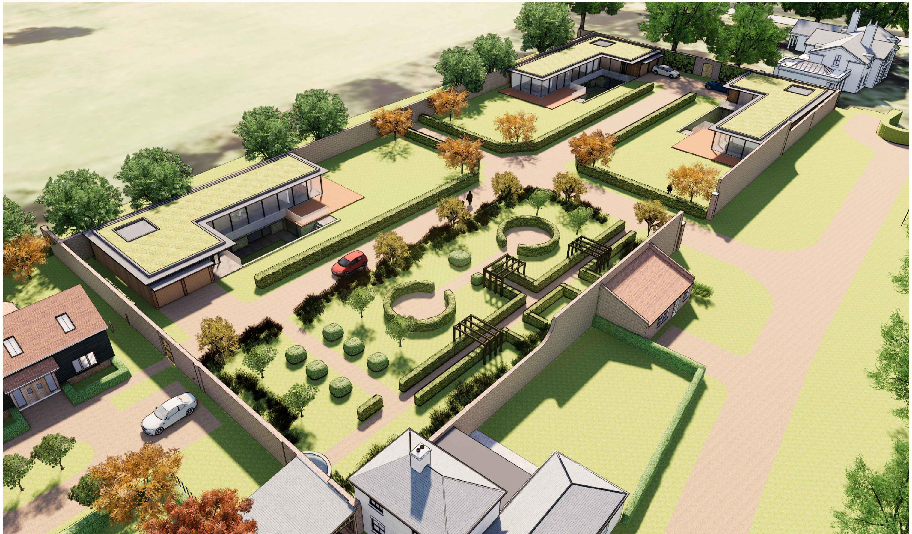
PROPOSED AERIAL VIEW, WALLED GARDEN