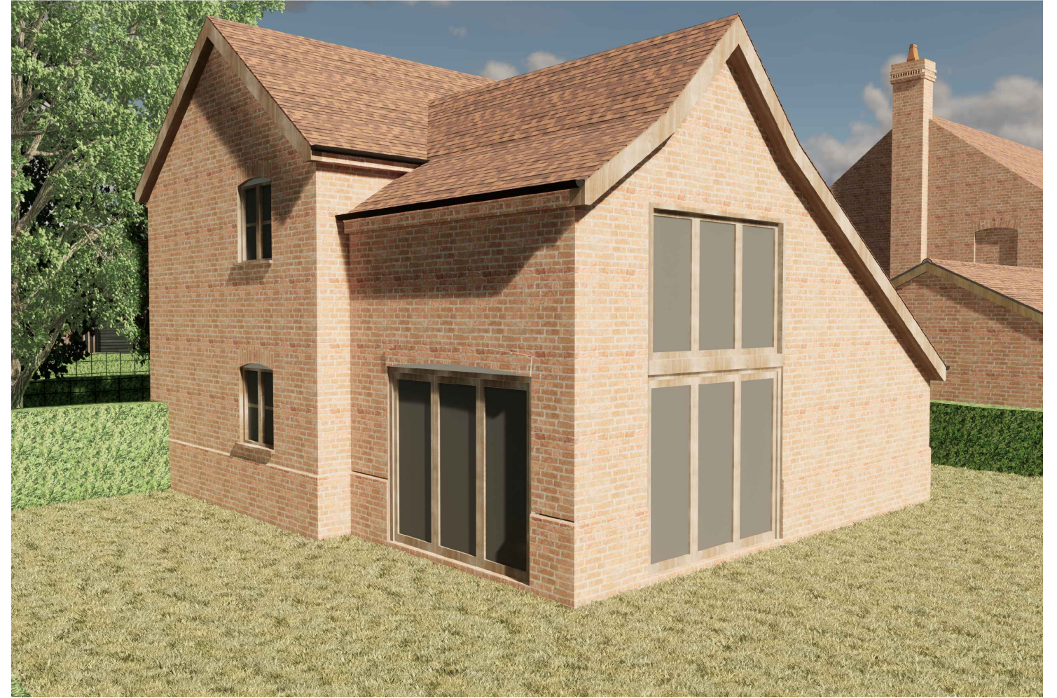
PROPOSED 3D REAR VIEW, DAIRY