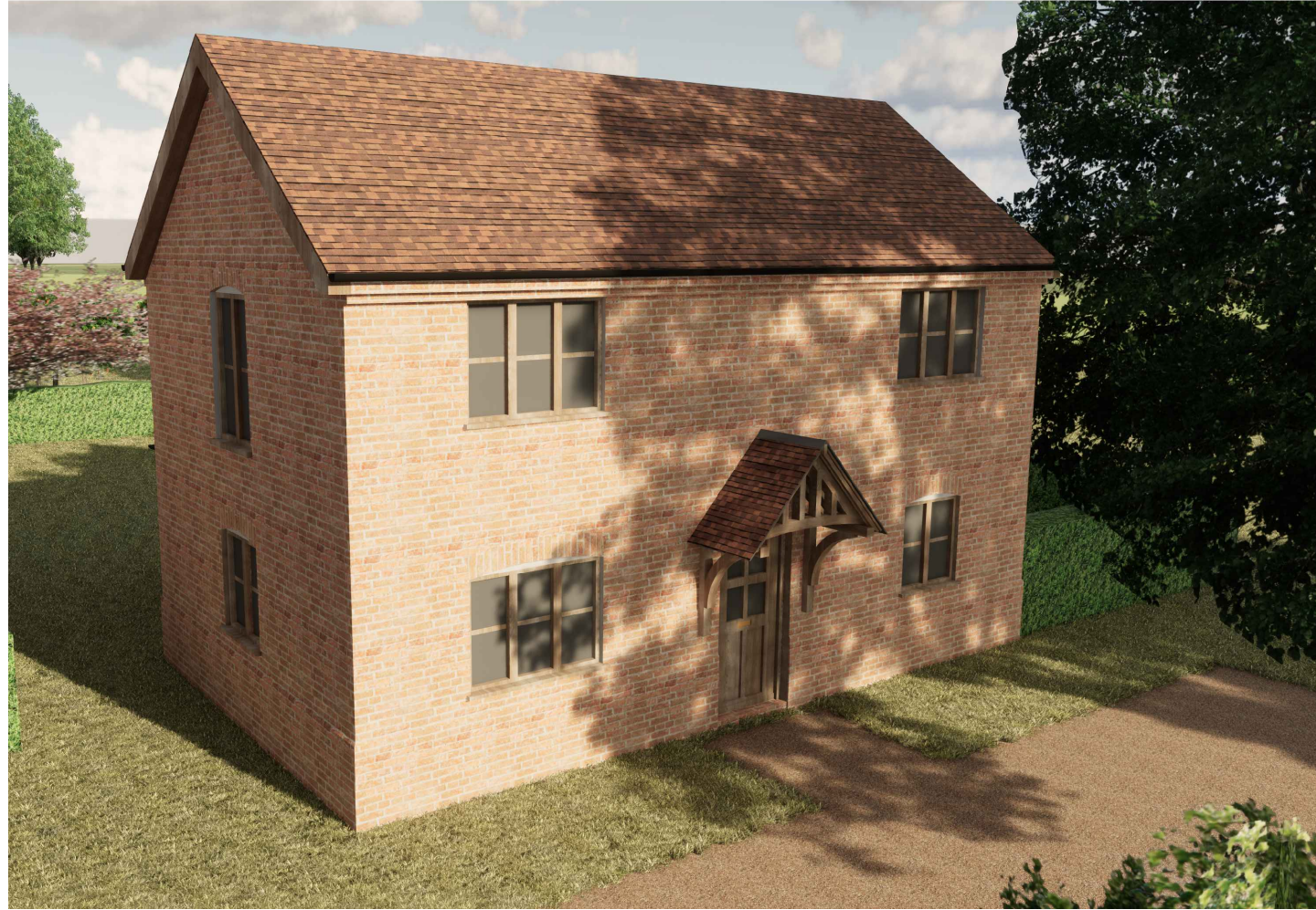
PROPOSED 3D FRONT VIEW, DAIRY