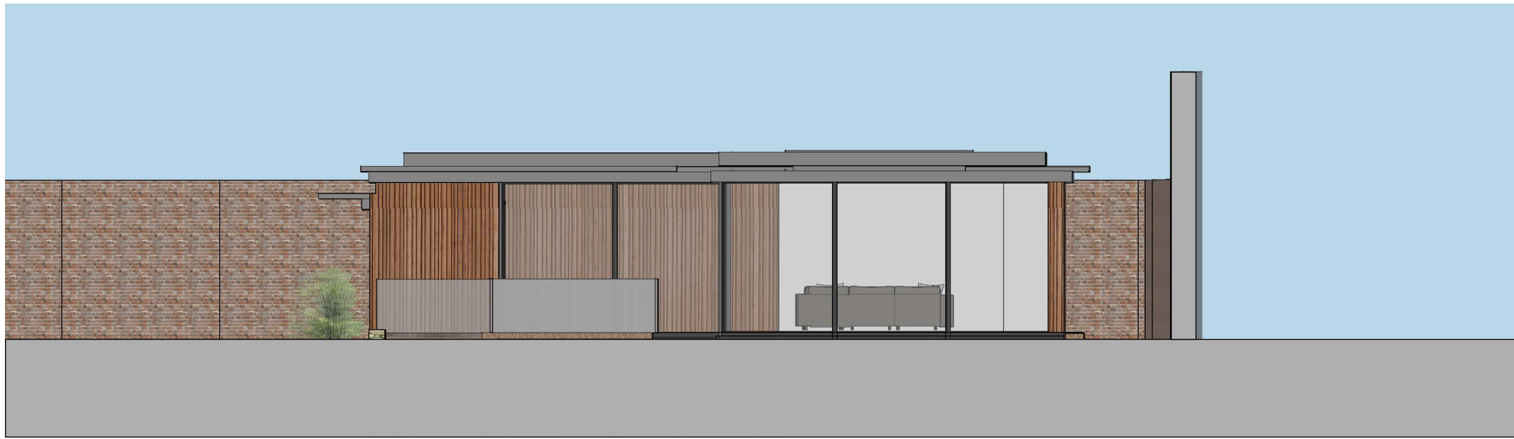
PROPOSED SIDE ELEVATION 1, WALLED GARDEN