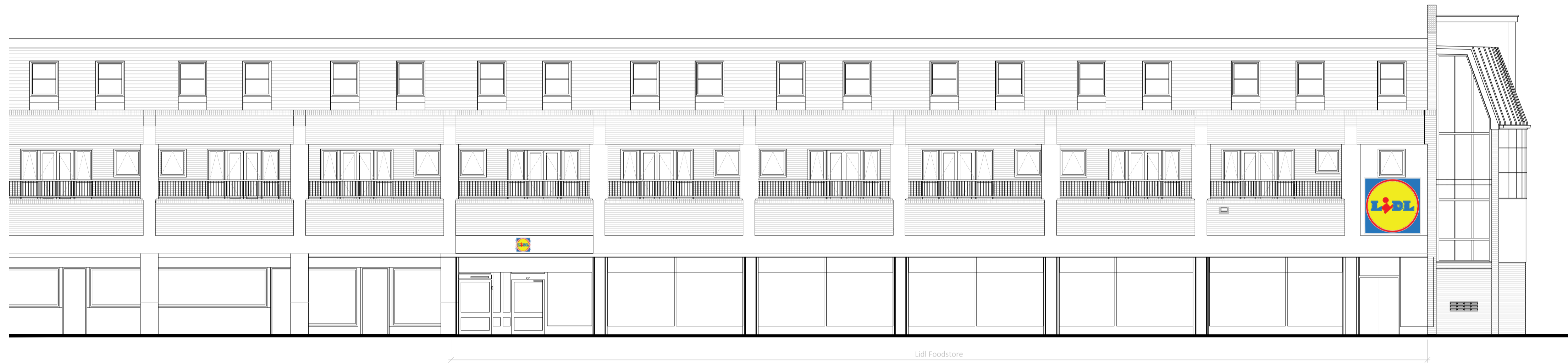
Existing Building Elevation SCALE 1:100