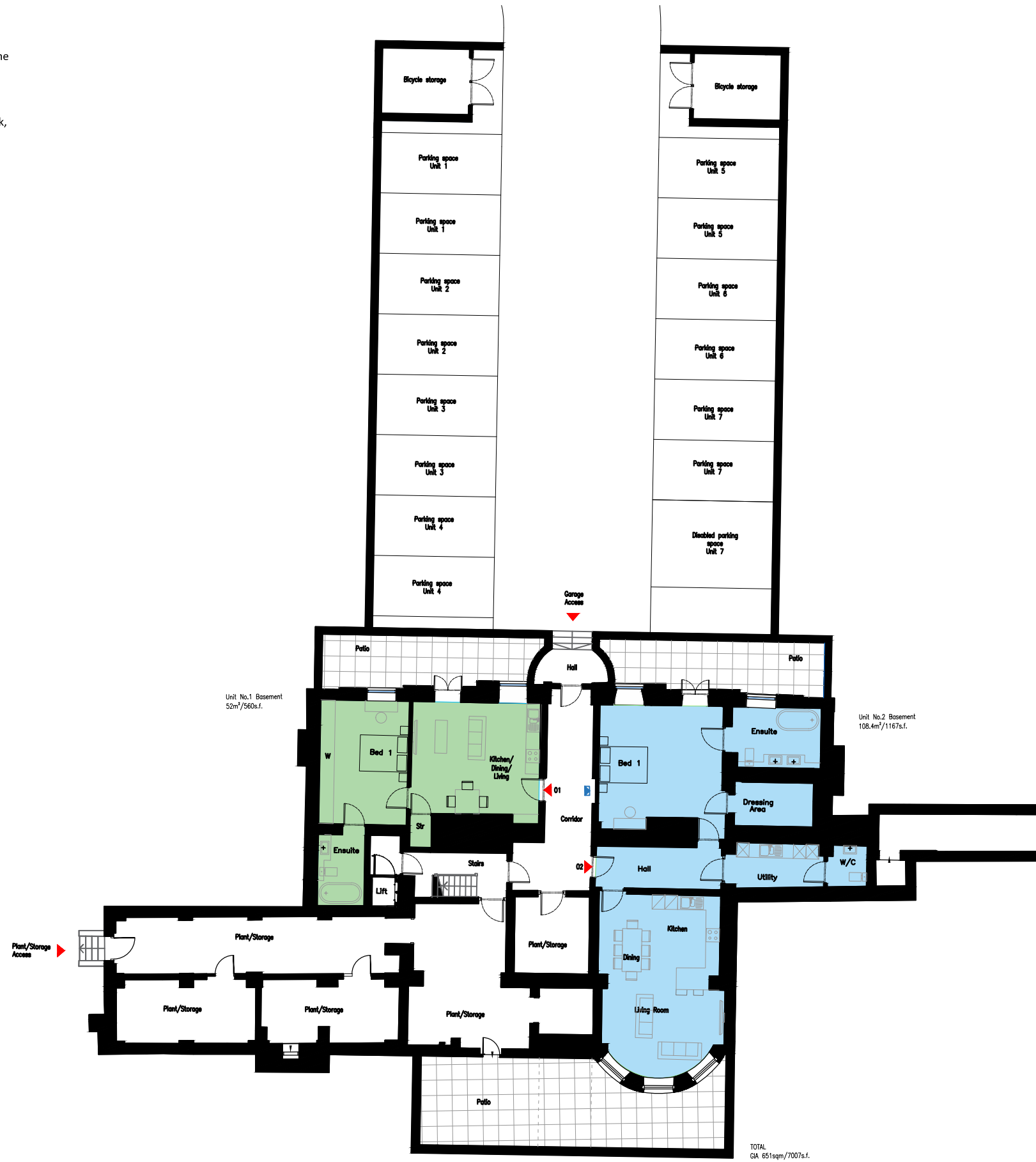
PROPOSED BASEMENT PLAN, MAIN HOUSE AND EDWARDIAN WING