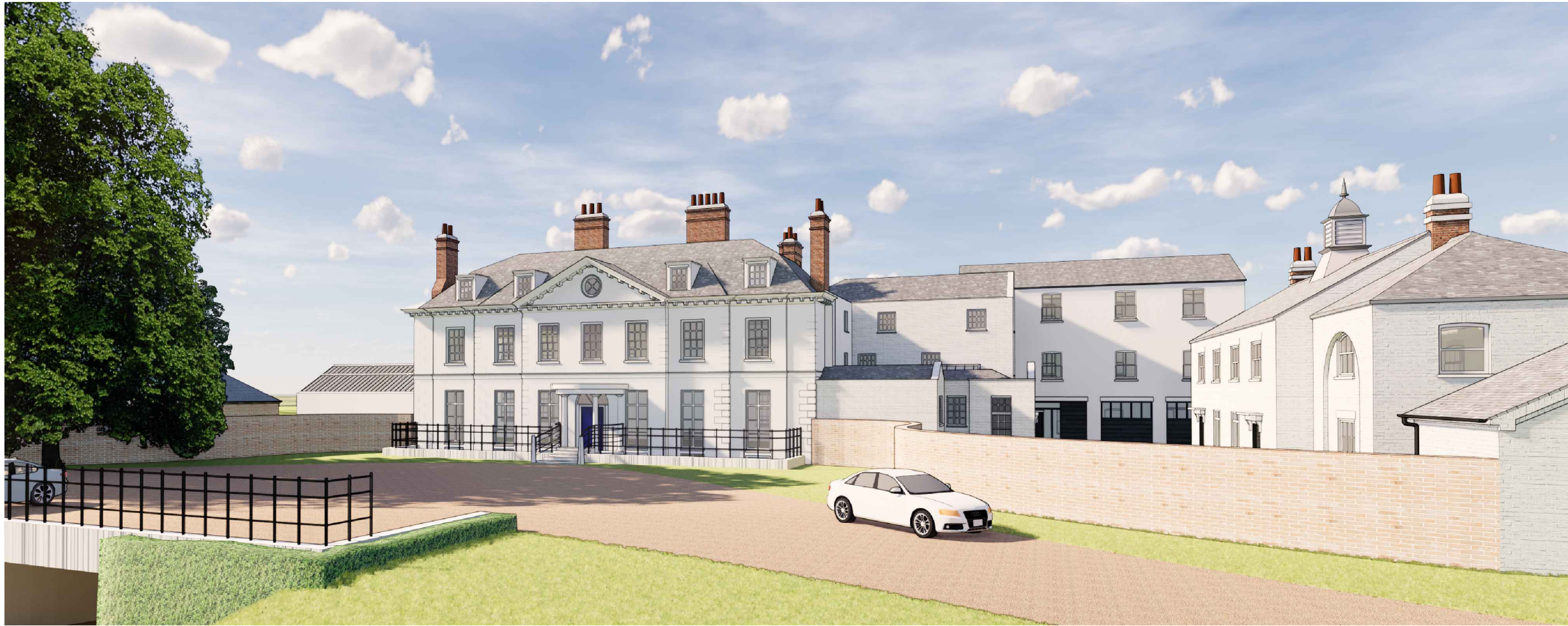
PROPOSED FRONT 3D VIEW, NORTHAW HOUSE