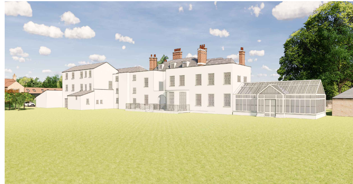
PROPOSED BACK 3D VIEW 2, NORTHAW HOUSE