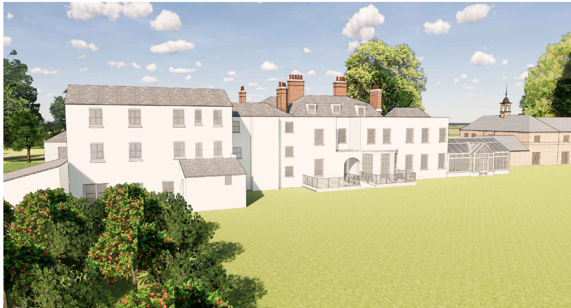
PROPOSED BACK 3D VIEW, NORTHAW HOUSE