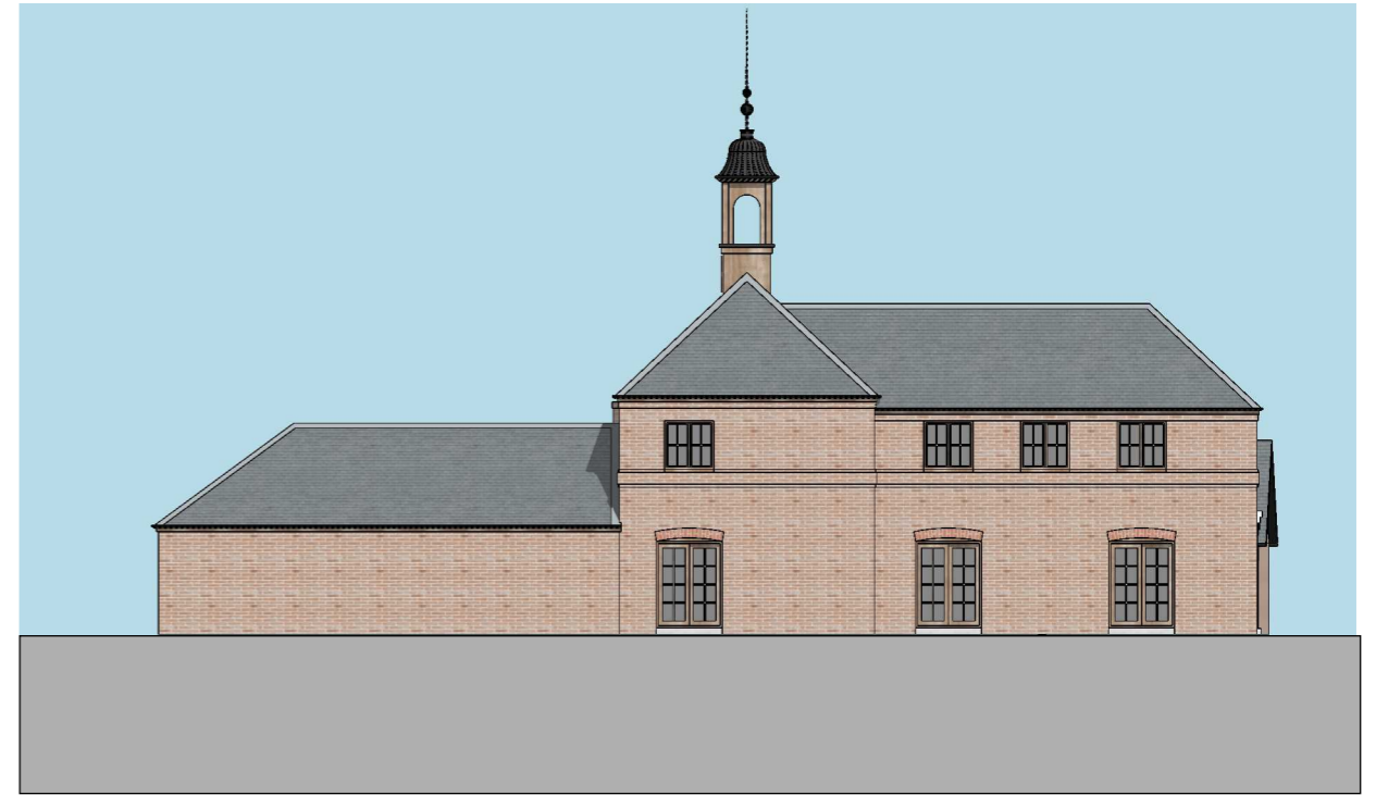
PROPOSED SOUTH ELEVATION, STABLE BLOCK