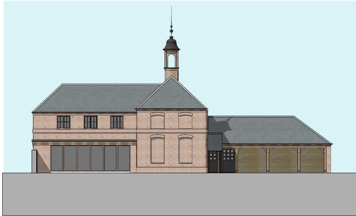
PROPOSED NORTH ELEVATION, STABLE BLOCK