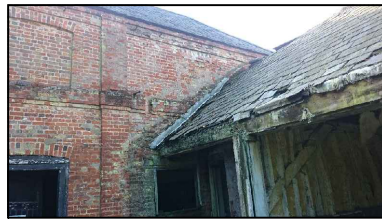
2. Cart House to be reconstructed