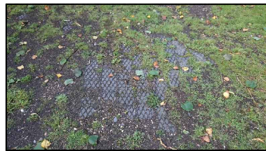
1. Diamond Paviors