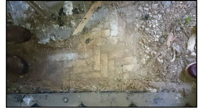
4. Retained flooring