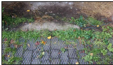
1. Diamond Paviors