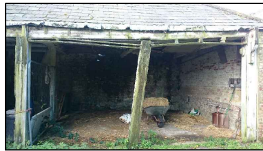
2. Cart House to be reconstructed