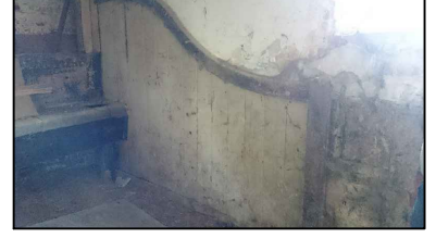
5. Retained stall