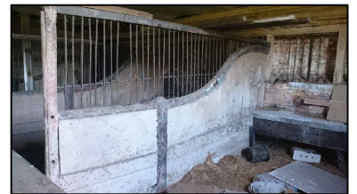
7. Retained stall