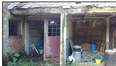
2. Cart House to be reconstructed