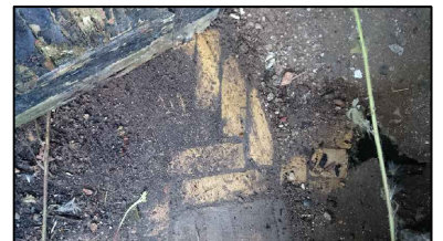
4. Retained flooring