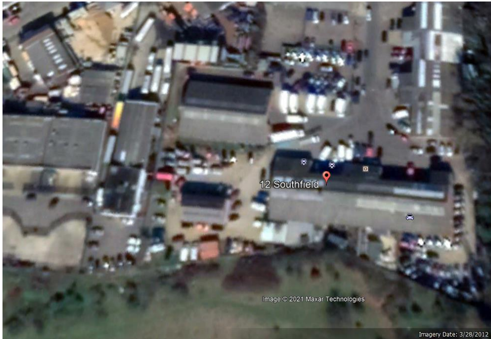
Google earth image showing the layout of the former use (28/03/2012)