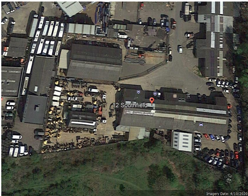
Google earth image demonstrating no material change in layout or appearance (04/10/2020)

6.18 The proposed plant hire use is therefore compatible with the character and appearance of this designated employment area, in accordance with saved Policies D1, D2 and EMP13 of the District Plan, emerging Policy SP 9 in the Draft District Plan and the NPPF.