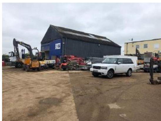
Parts of the large yard which is used for parking and storage