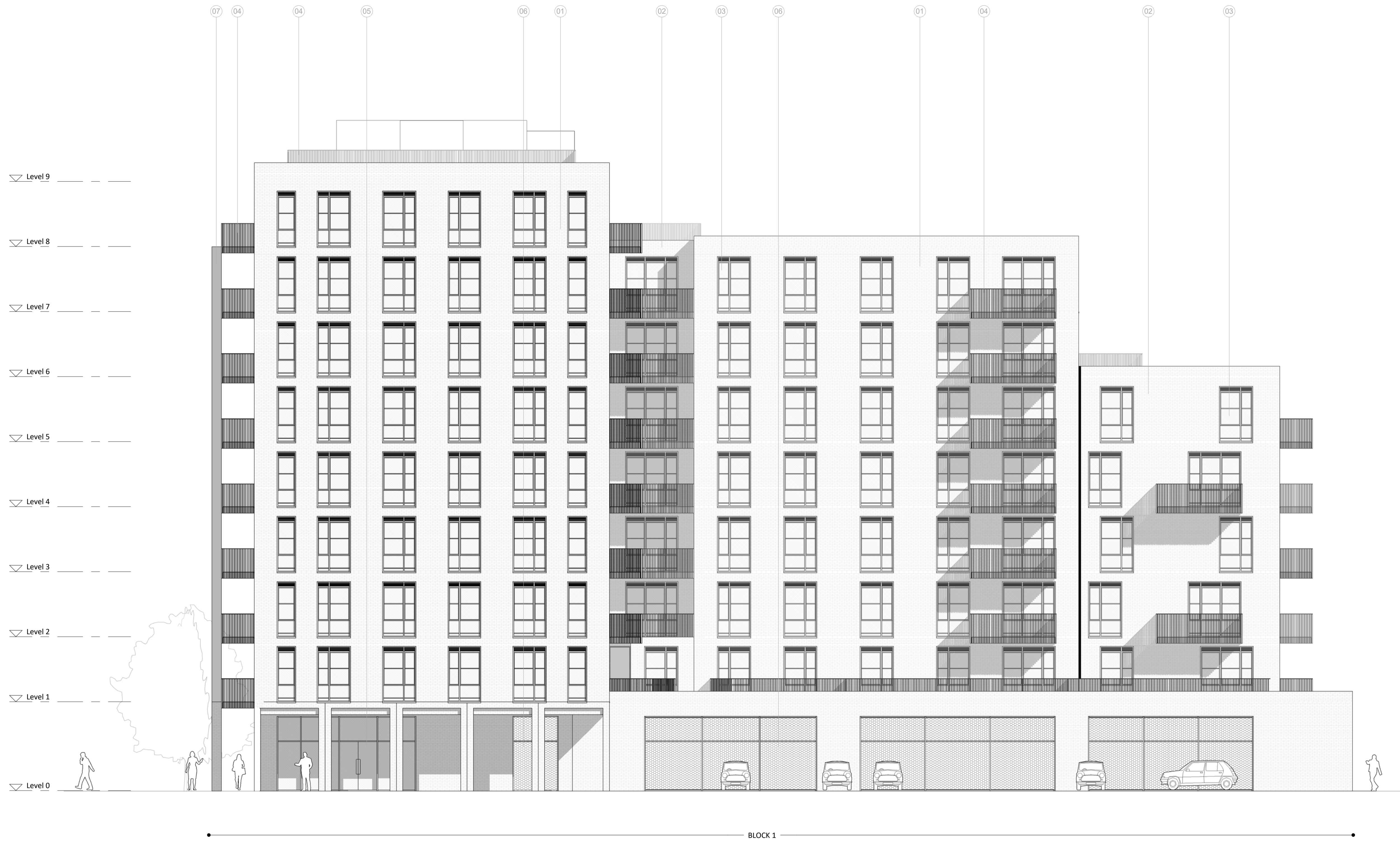
1 North East Elevation 1 : 100

NOTES CONSULTANTS - Refer to highways consultant's drawings for details - Refer to landscape consultant's drawings for details - Landscaping layout is indicative only AREAS - Refer to area schedule © Copyright Reserved. ColladoCollins Architects Ltd