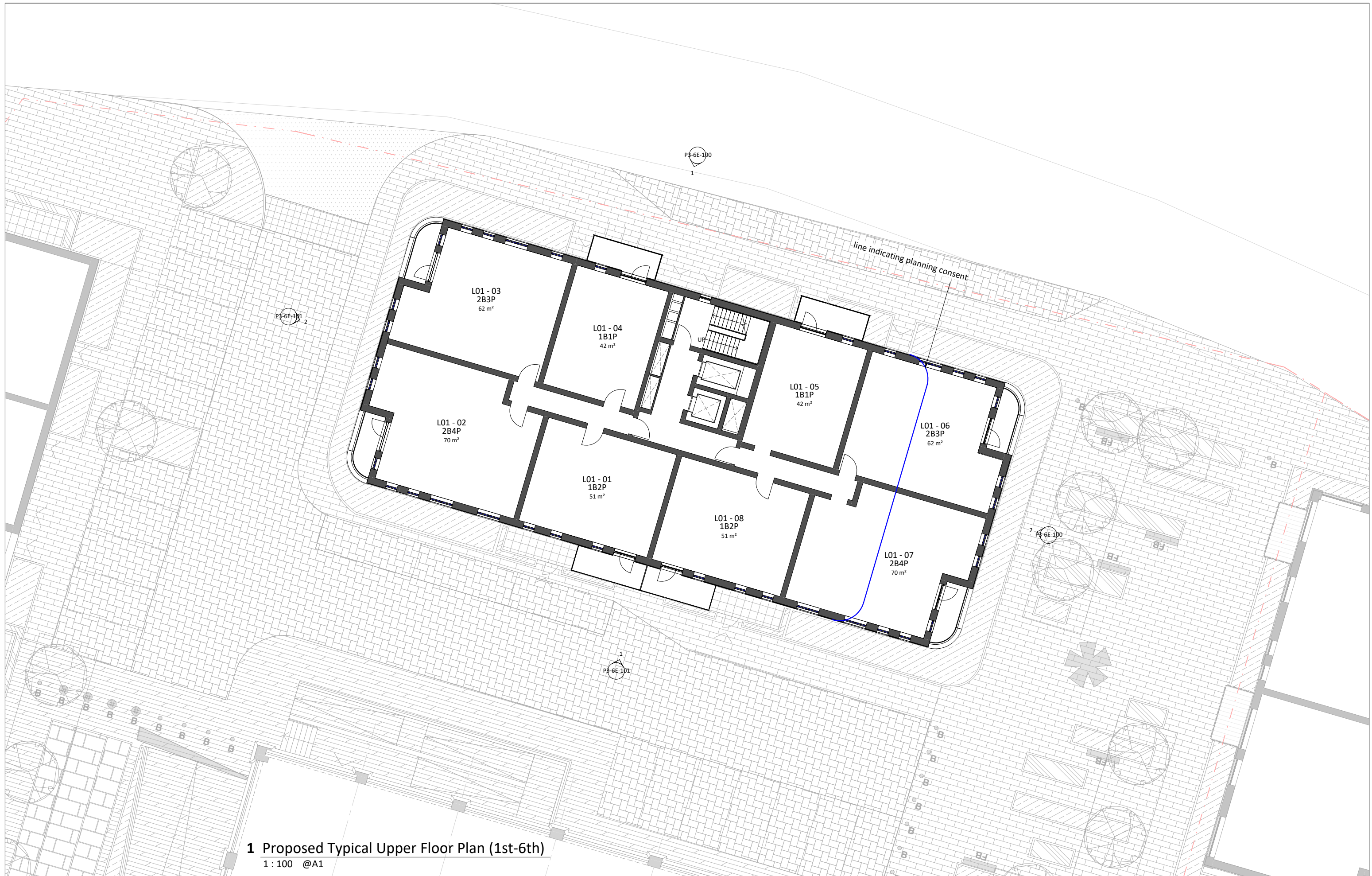
1 Proposed Typical Upper Floor Plan (1st-6th) 1 : 100 @A1