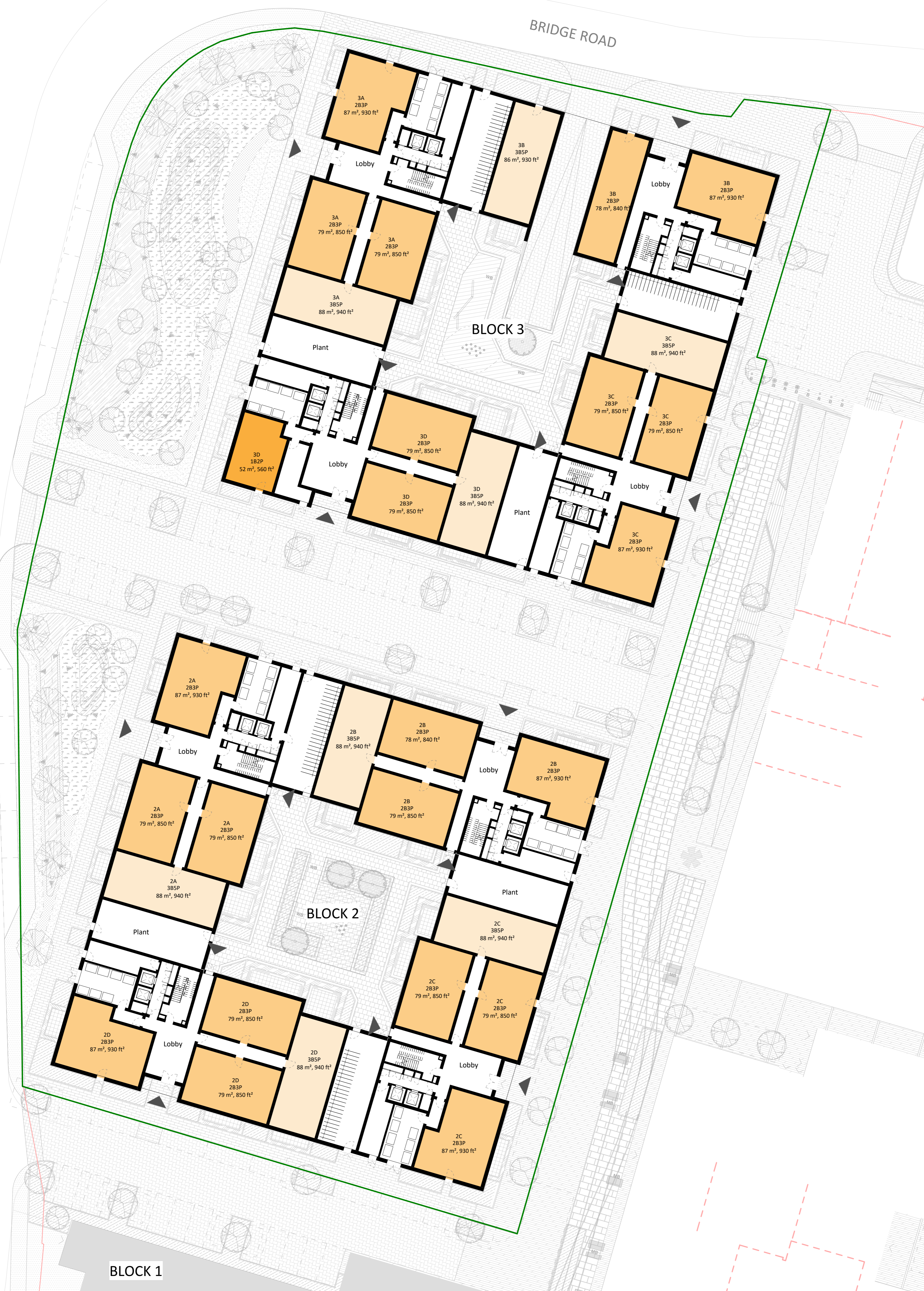
1 Indicative Ground Floor Plan - Blocks 2&3 1 : 250