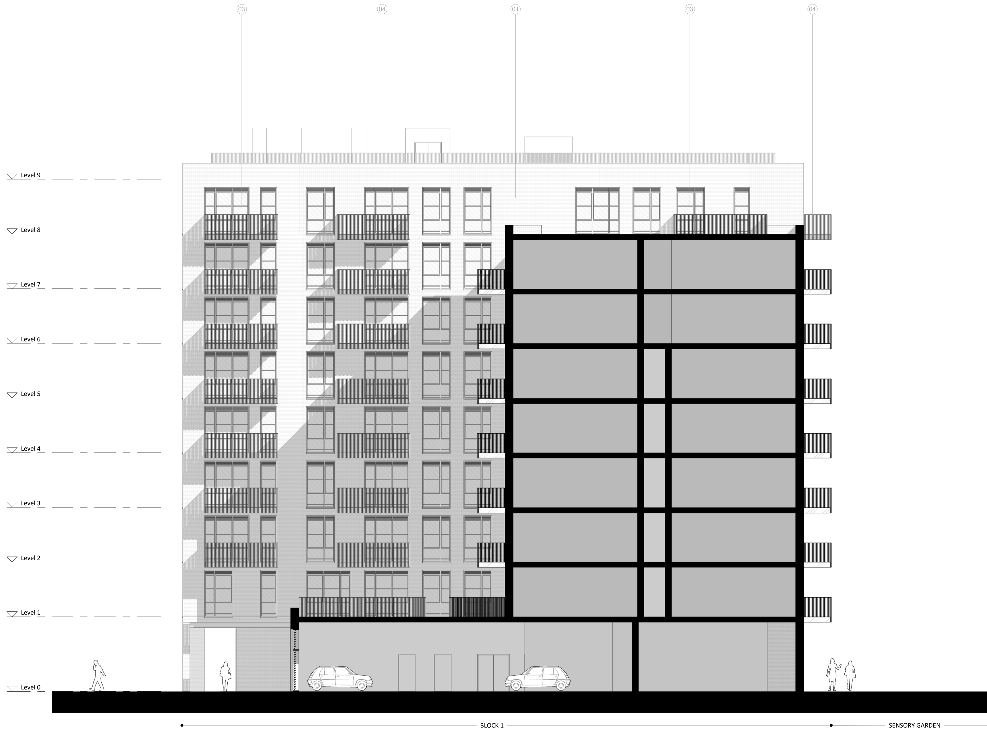
2 Proposed Section 1 : 100

NOTES CONSULTANTS - Refer to highways consultant's drawings for details - Refer to landscape consultant's drawings for details - Landscaping layout is indicative only AREAS - Refer to area schedule © Copyright Reserved. ColladoCollins Architects Ltd