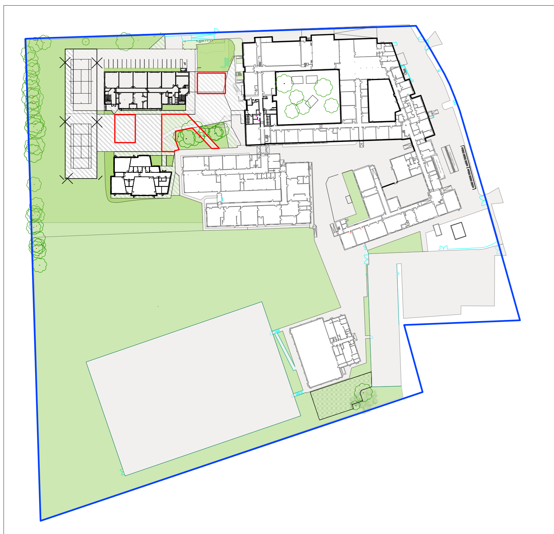
Existing Location Plan Scale 1:1250

NOTES: All other design team elements, where indicated, have been imported from the consultant's drawings and reference should be made to the individual consultant's drawings for exact setting out, size and type of component. Discrepancies and / or ambiguities within this drawing, between it and the information given elsewhere, must be reported immediately to the architect for clarification before proceeding. All works are to be carried out in accordance with the latest British Standards and Codes of Practice unless specifically directed otherwise in the specification. Responsibility for the reproduction of this drawing in paper form, or if issued in electronic format, lies with the recipient to check that all information has been replicated in full and is correct when compared to the original paper or electronic image. Graphical representations of equipment on this drawing have been co-ordinated, but are approximations only. Please refer to the Specifications and / or Details for actual sizes and / or specific contractor construction information.