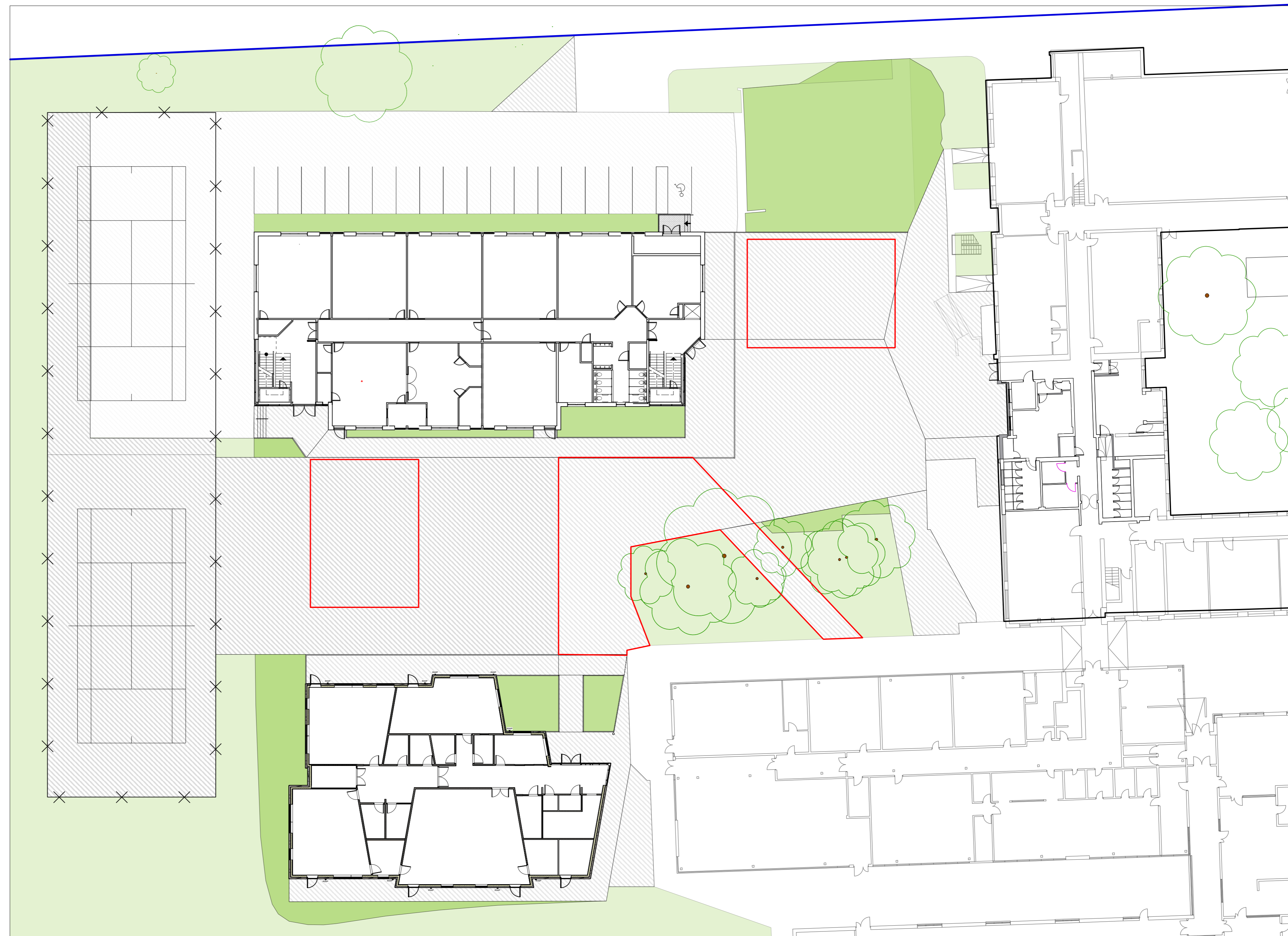
Existing Site Plan Scale 1:250