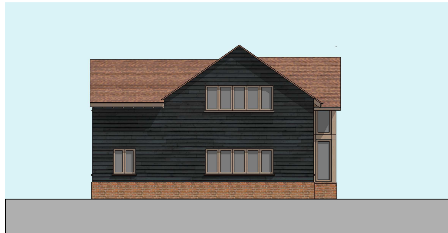
SIDE 2 ELEVATION