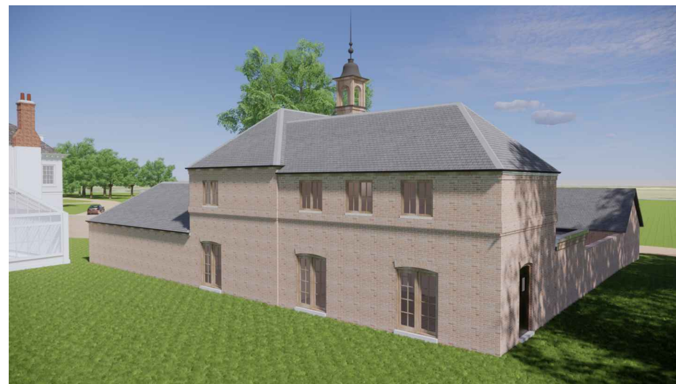
PROPOSED BACK 3D VIEW, STABLE BLOCK