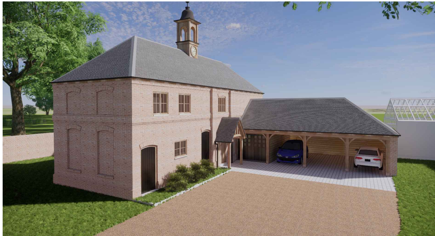
PROPOSED FRONT 3D VIEW, STABLE BLOCK