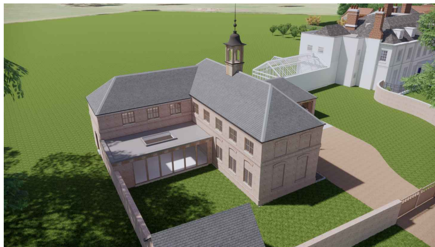
PROPOSED FRONT AERIAL VIEW, STABLE BLOCK