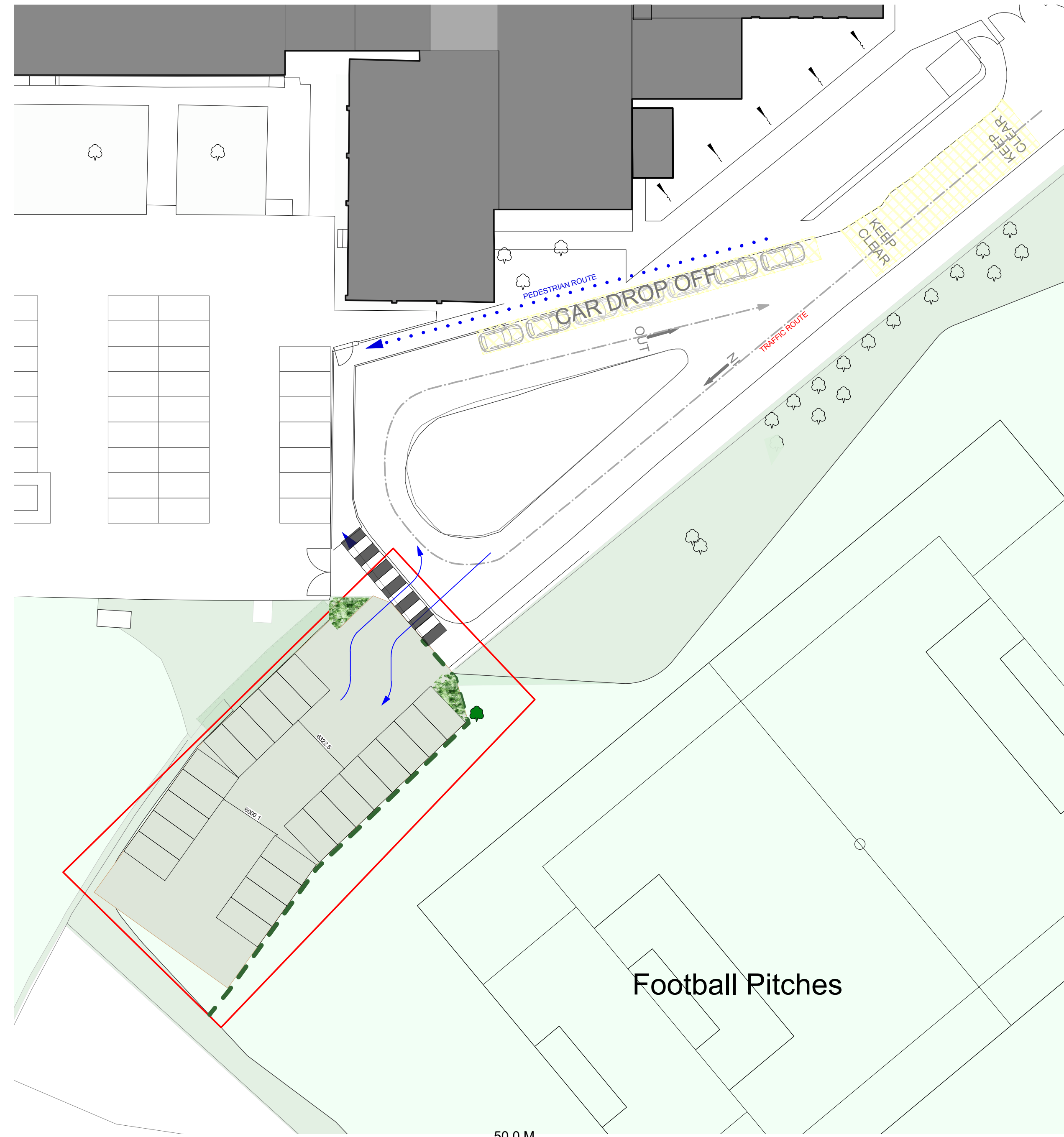
Site Plan 1:300