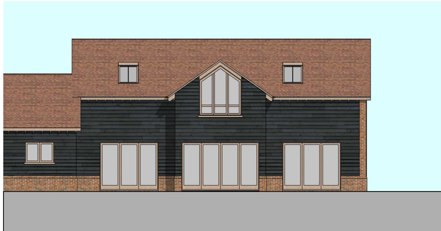
PROPOSED SOUTH ELEVATION, SETTLEMENT UNIT 2