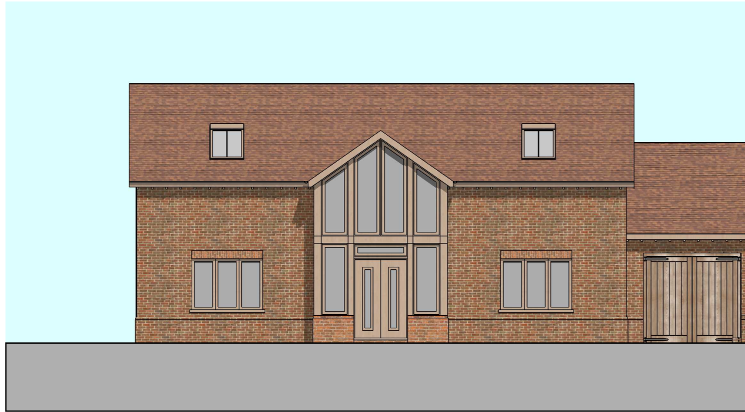
PROPOSED NORTH ELEVATION, SETTLEMENT UNIT 2