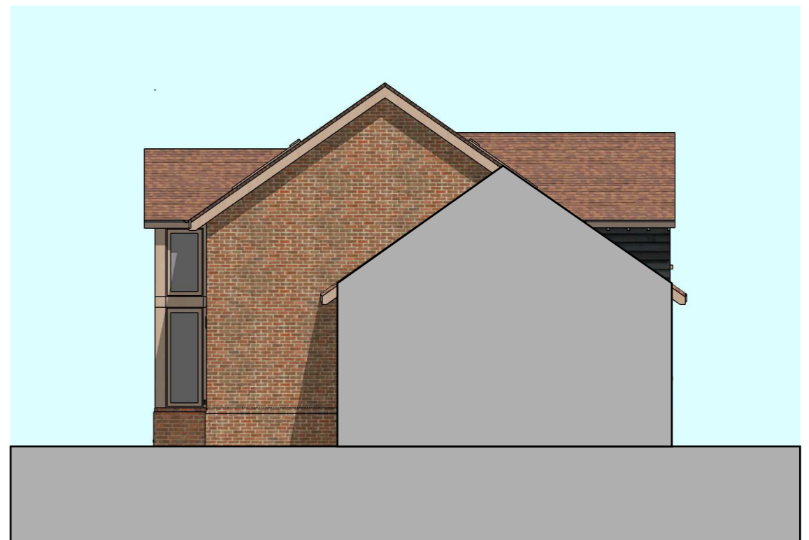
PROPOSED EAST ELEVATION, SETTLEMENT UNIT 2