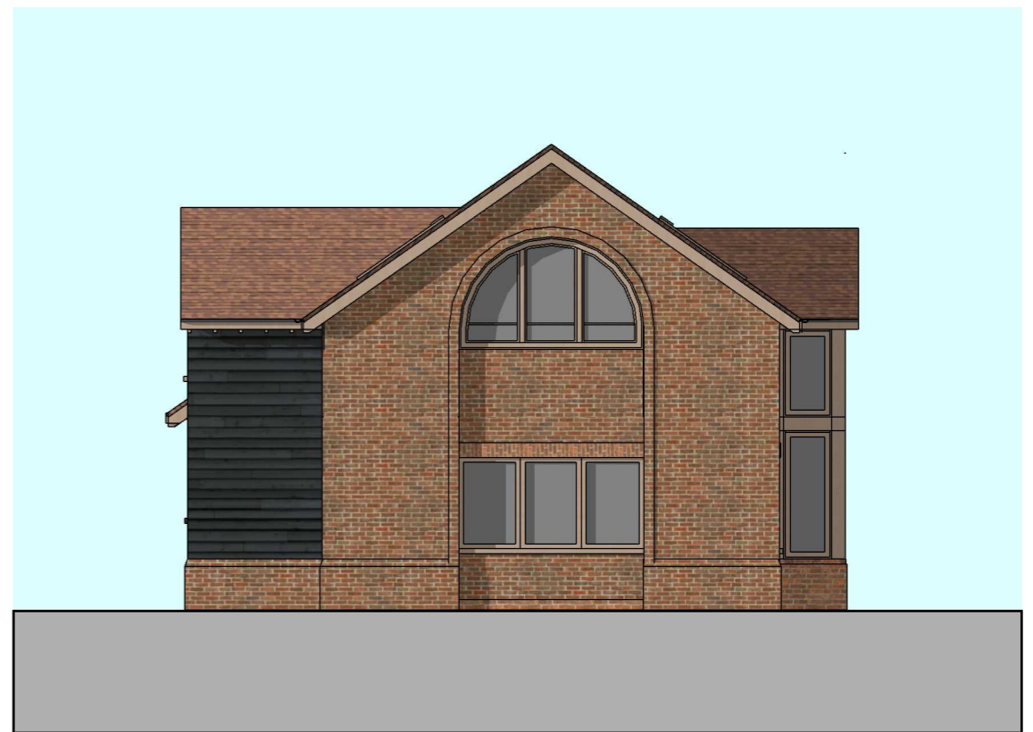
PROPOSED WEST ELEVATION, SETTLEMENT UNIT 2