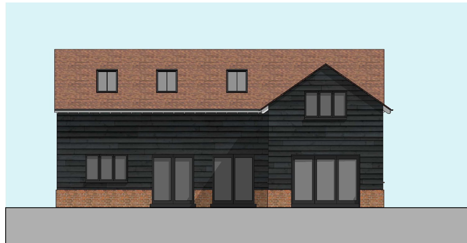
PROPOSED BACK ELEVATION, SETTLEMENT UNIT 1