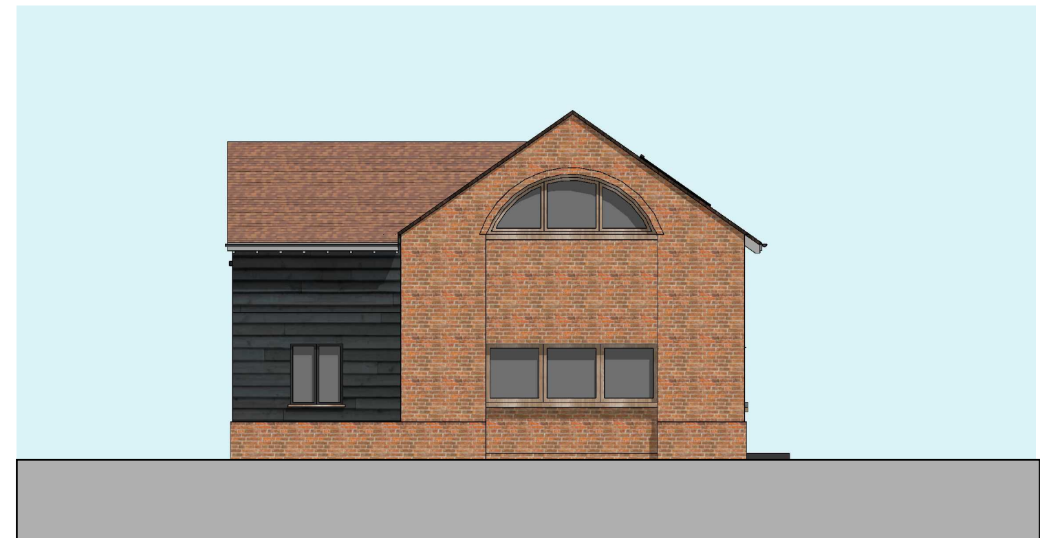
PROPOSED SIDE 2 ELEVATION, SETTLEMENT UNIT 1