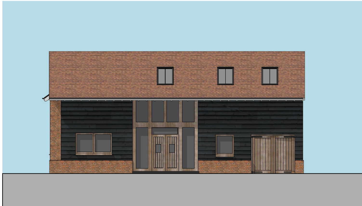
PROPOSED FRONT ELEVATION, SETTLEMENT UNIT 1