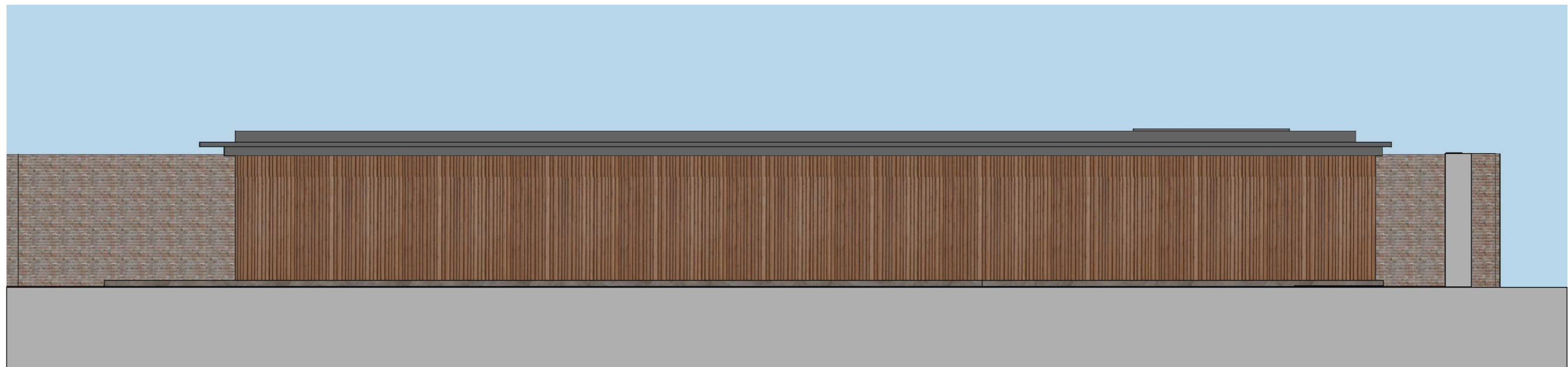
PROPOSED BACK ELEVATION, WALLED GARDEN