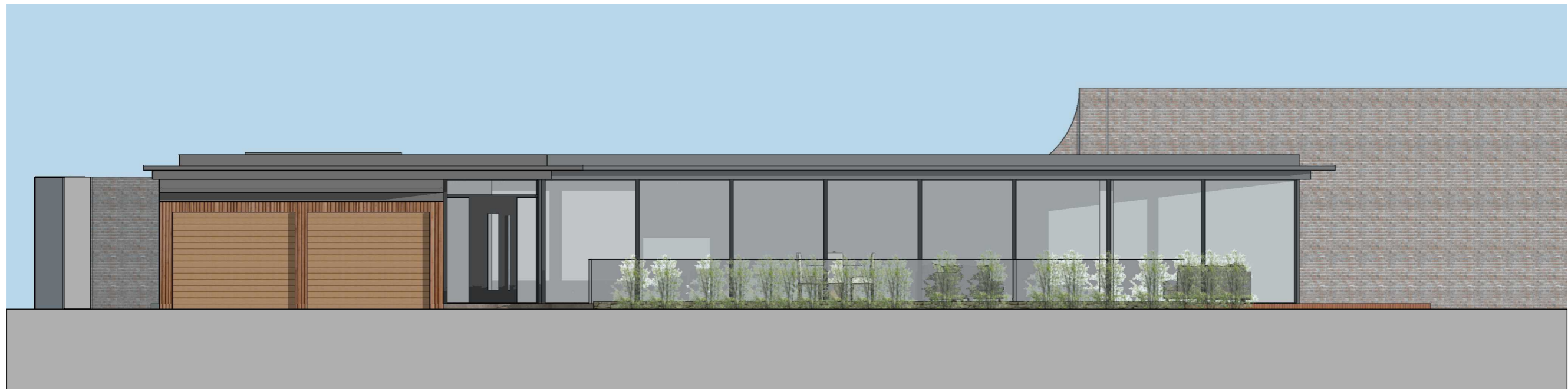
PROPOSED FRONT ELEVATION, WALLED GARDEN