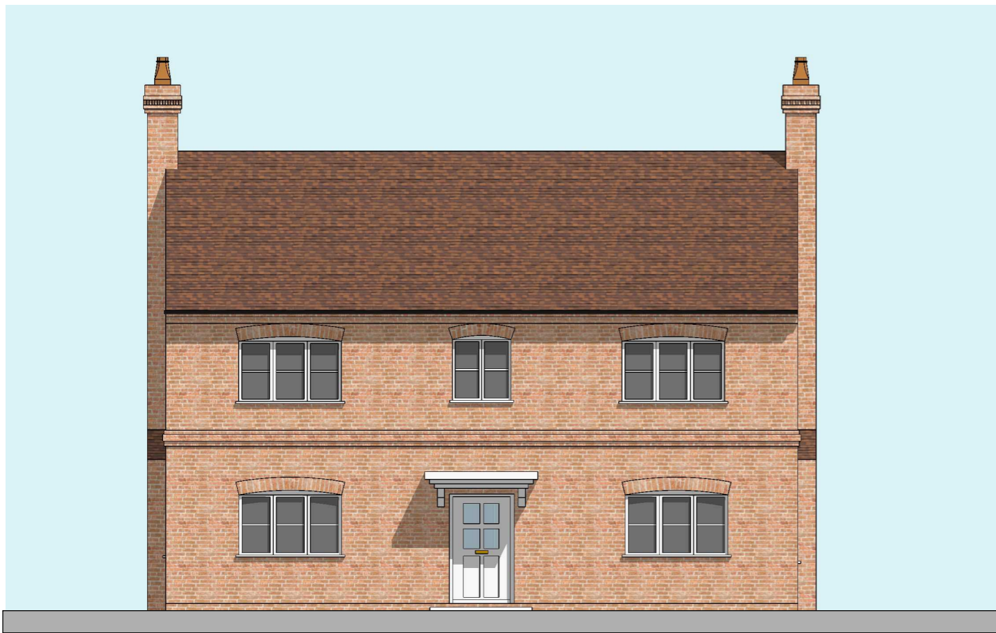
PROPOSED FRONT ELEVATION, FARM HOUSE