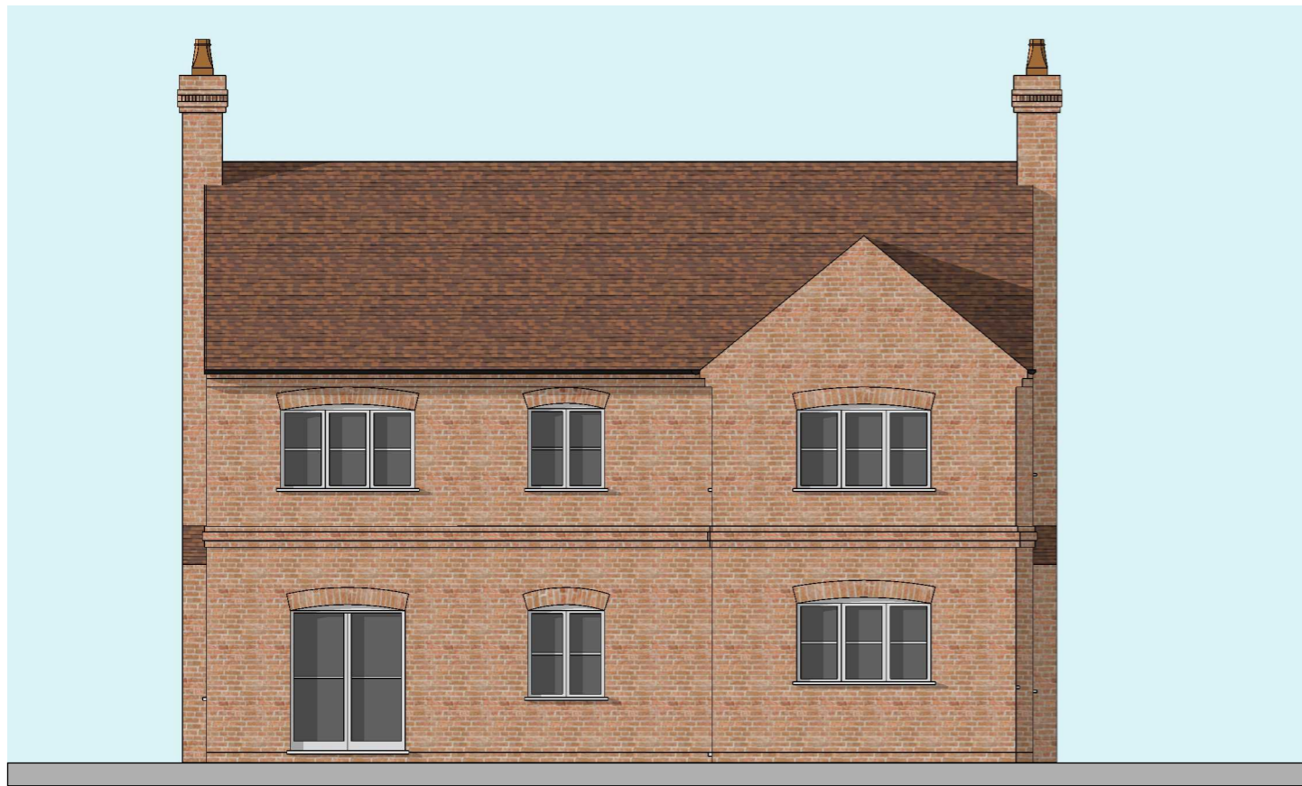
PROPOSED BACK ELEVATION, FARM HOUSE