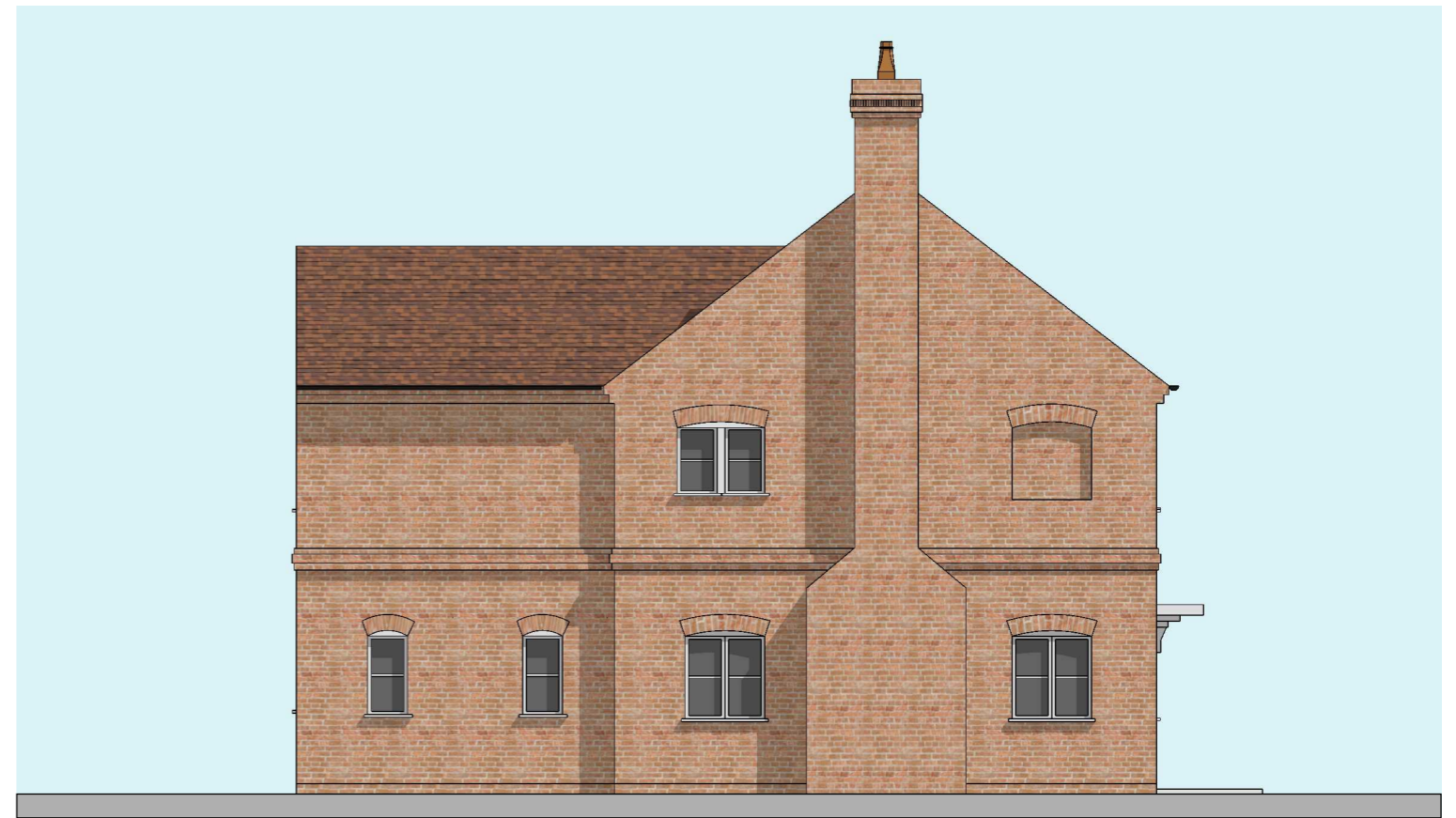
PROPOSED SIDE ELEVATION 2, FARM HOUSE