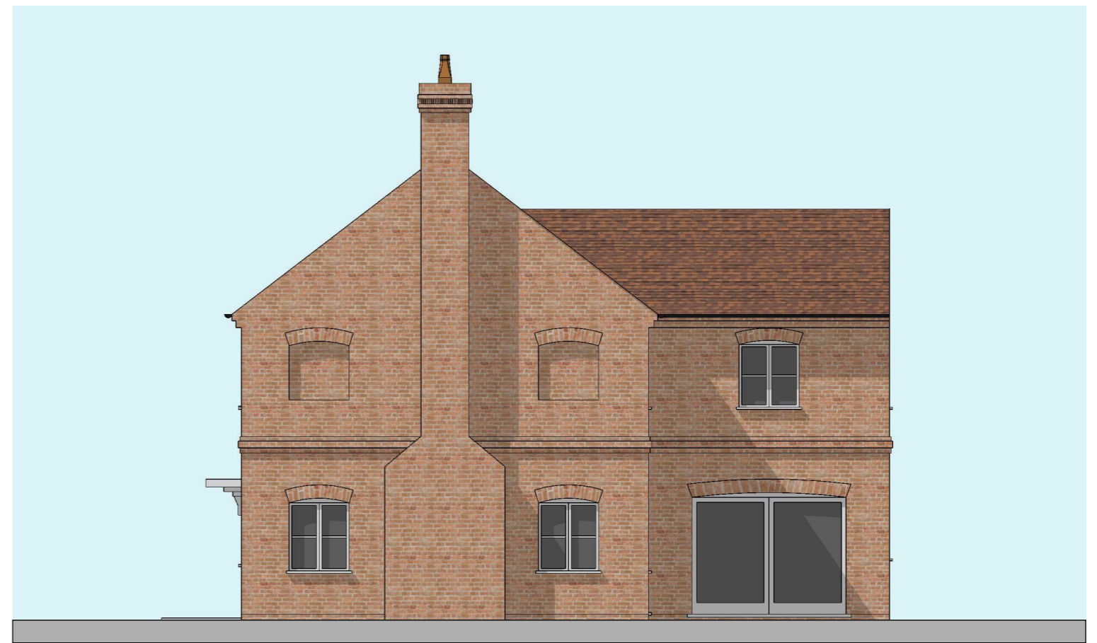
PROPOSED SIDE ELEVATION 1, FARM HOUSE