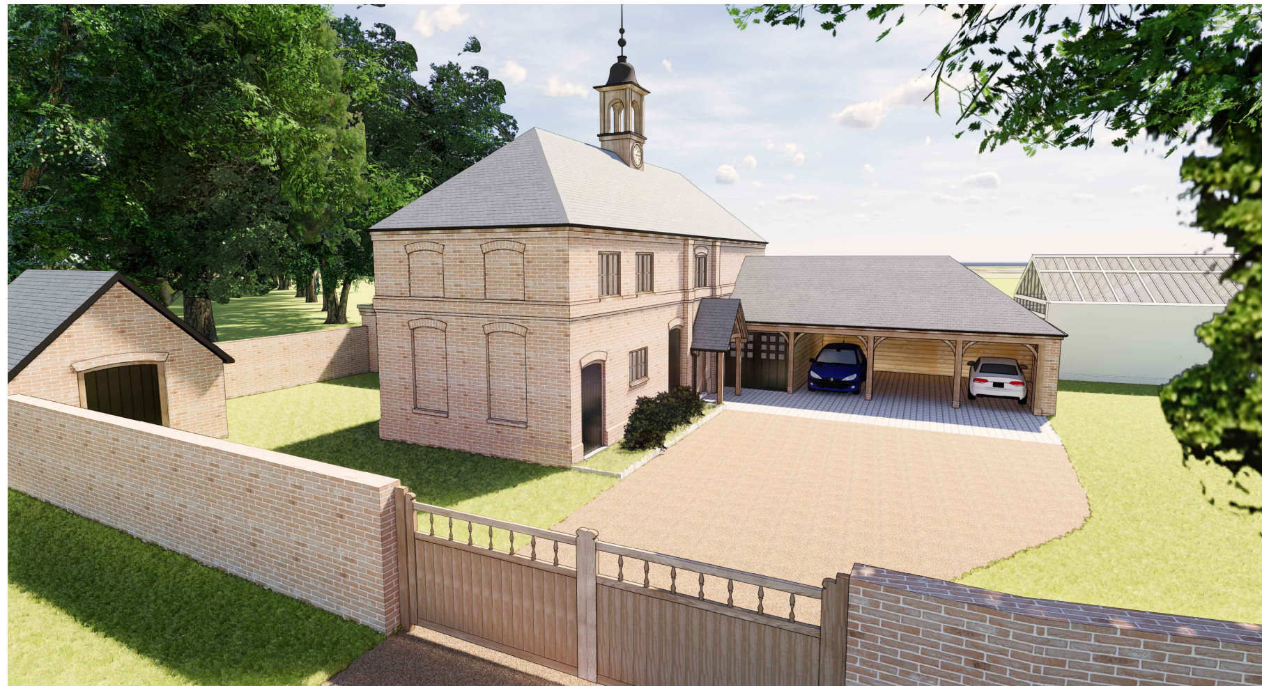
PROPOSED FRONT 3D VIEW, STABLE BLOCK