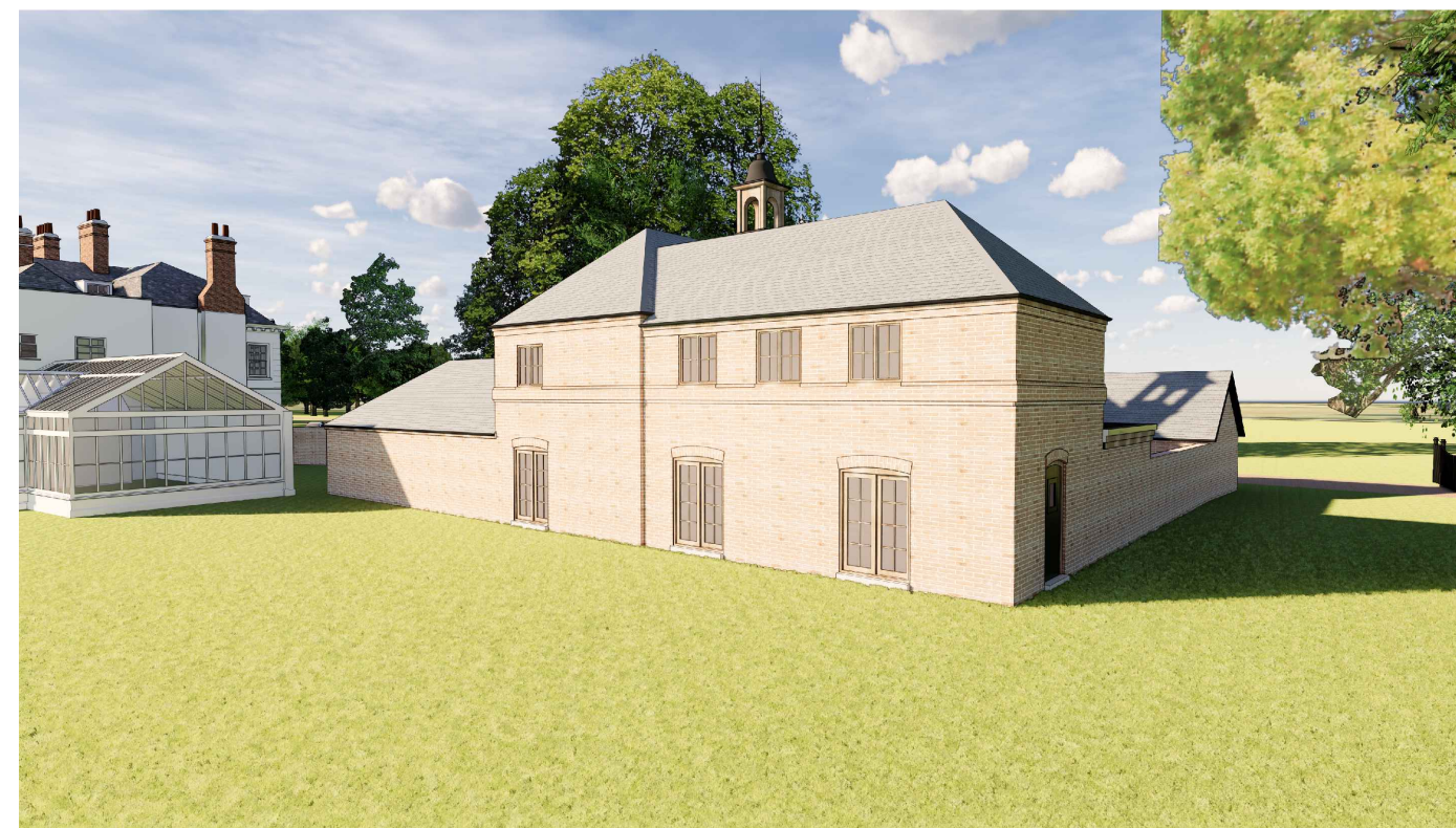
PROPOSED BACK 3D VIEW, STABLE BLOCK