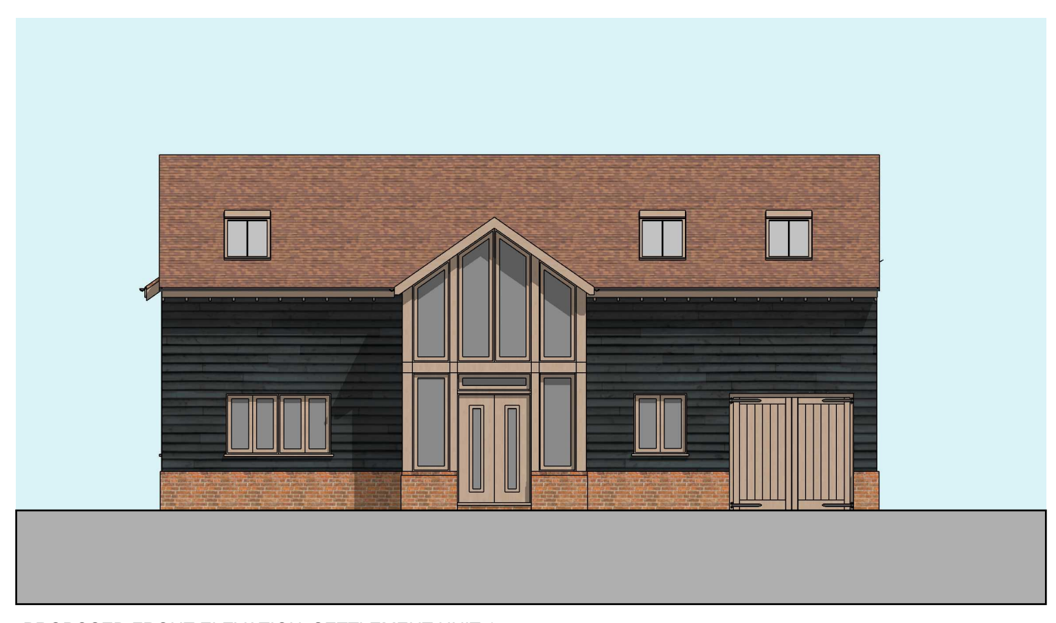
PROPOSED FRONT ELEVATION, SETTLEMENT UNIT 1