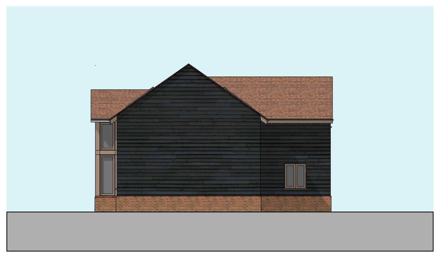
PROPOSED SIDE 1 ELEVATION, SETTLEMENT UNIT 1