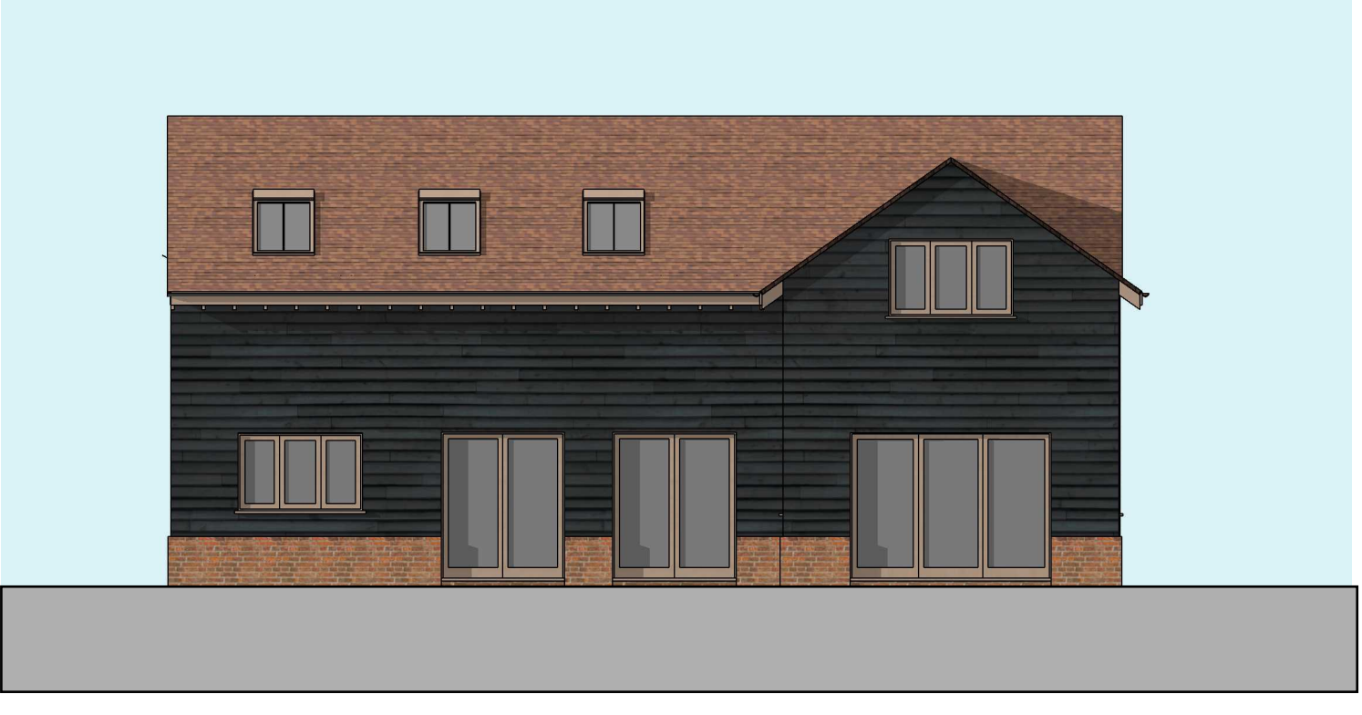
PROPOSED SIDE 2 ELEVATION, SETTLEMENT UNIT 1