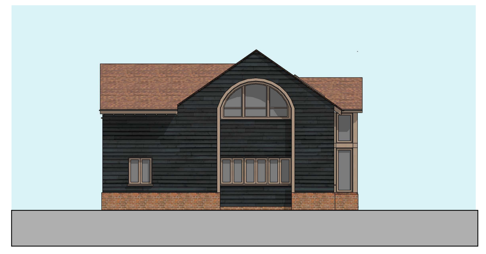
PROPOSED BACK ELEVATION, SETTLEMENT UNIT 1