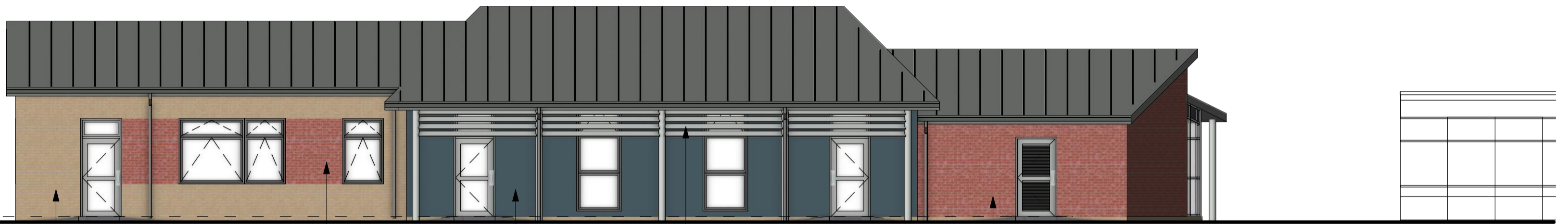
D South East Elevation

Brick 2 Curtain wall Render 1 colour ref tbc Render 2 colour ref tbc