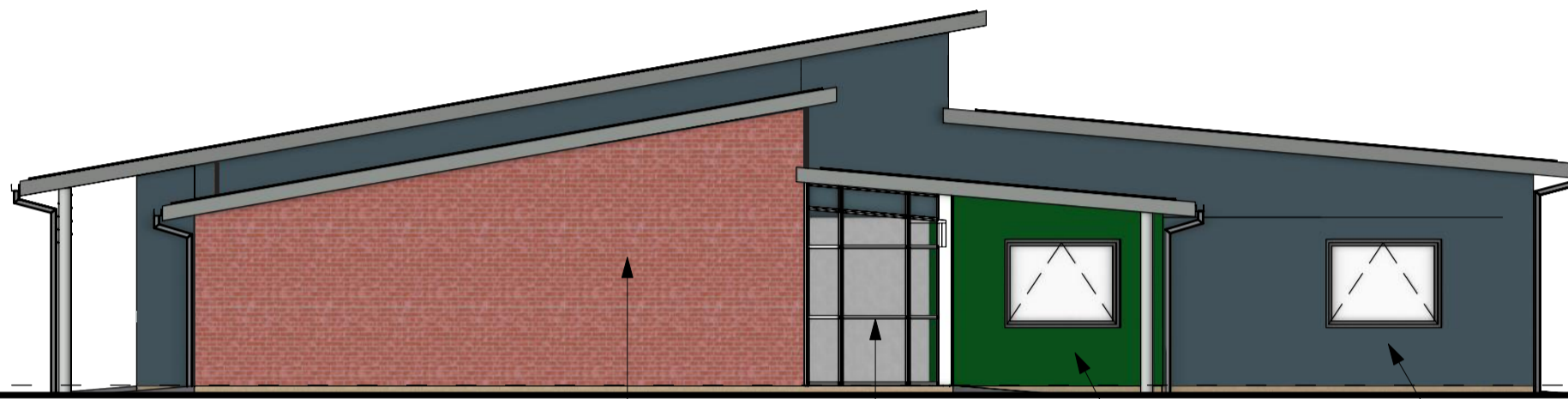
C North East Elevation

Curtain wall Render 1 colour ref tbc Render 2 colour ref tbc Brick 1 Brick 2