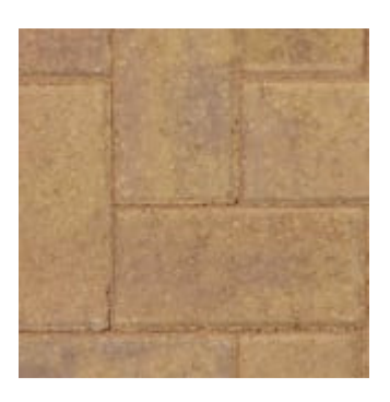
Secondary Route – Parking Court Marshalls Priora, Colour Bracken

Primary Route into development Marshalls Keyblok, Colour: Bracken.