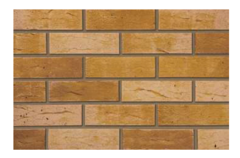
Brick Type B (as noted on Drg No. 21188-Materials Plan-01) lbstock – Surrey Red Multi-Ref 4133.