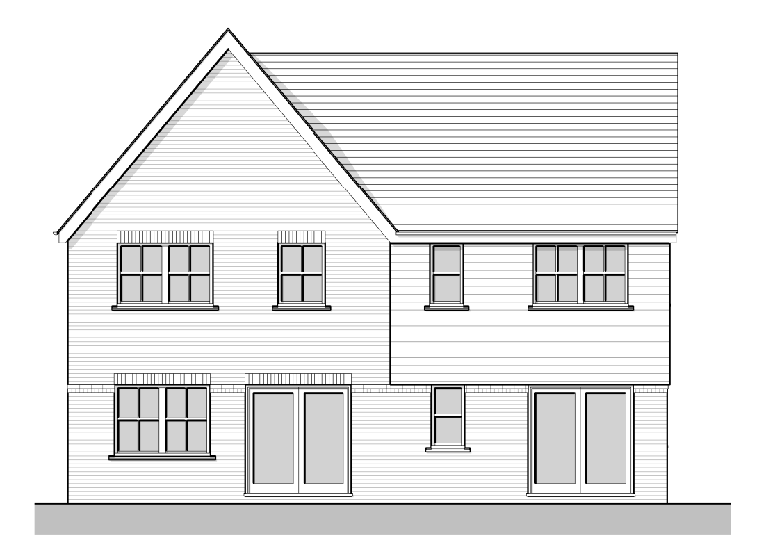
Plots 9 & 10