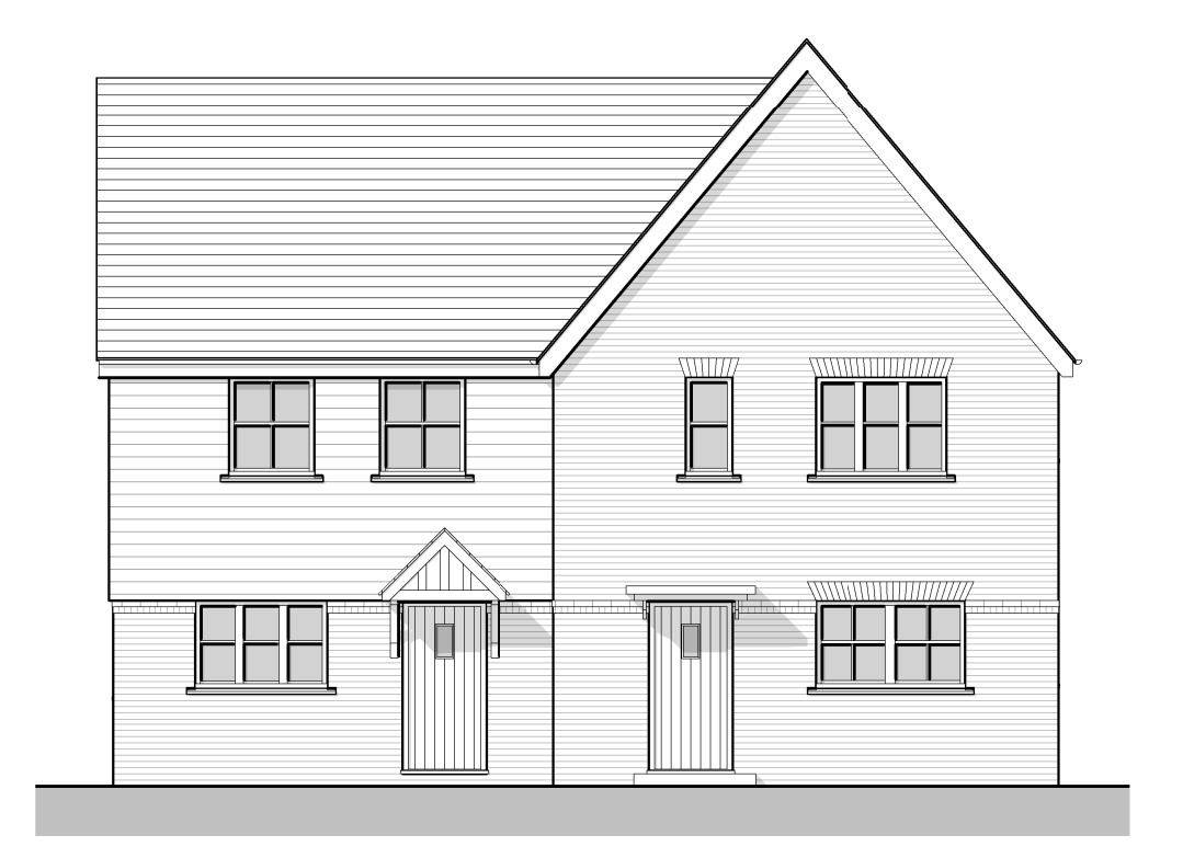
Plots 8 & 11