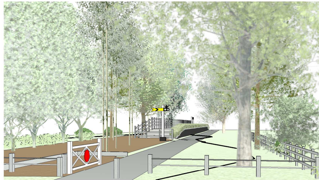
View from Road