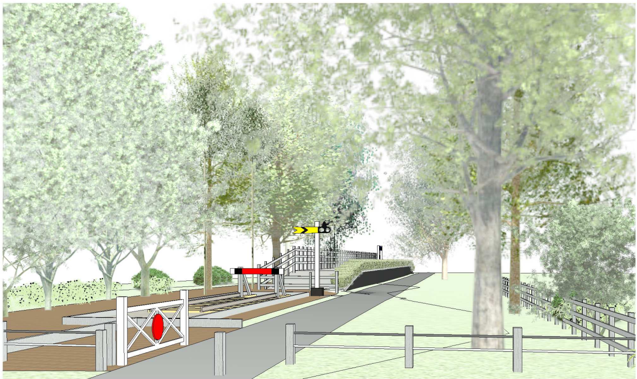
View from Road